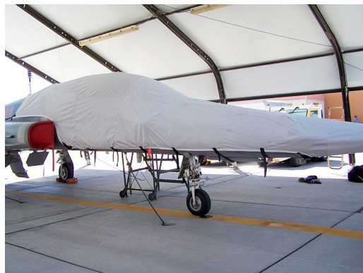
Northup F5 Talon Canopy Cover