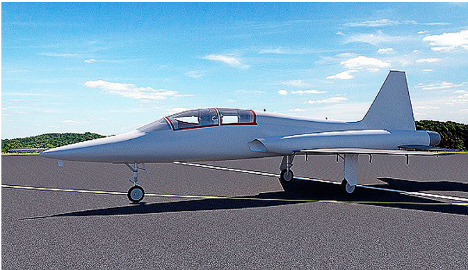
T-38 Talon Wing and Horizontal Stabilizer Covers (3D Rendering)