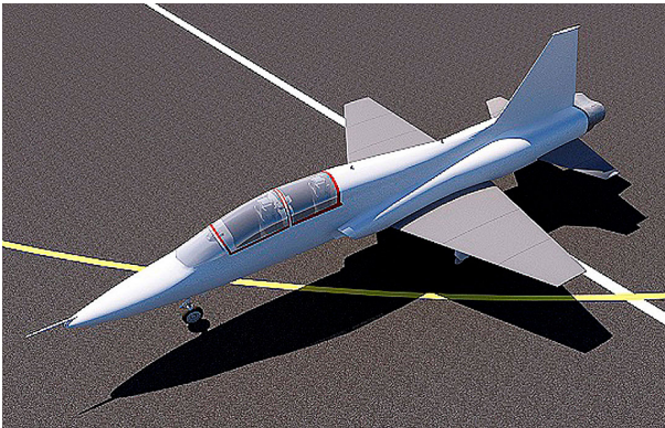
T-38 Talon Wing and Horizontal Stabilizer Covers (3D Rendering)

WINTER USE MATERIAL - Made with Solution-Dyed Polyester fabric, this option is intended for seasonal use to aid in deicing, rain mitigation, or for occasional travel. The material is lighter and more compact, but more susceptible to UV damage and may have a shorter useful life if used continuously outside than the all-year use material.