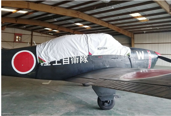
Fuji LM Canopy Cover

This cover type is made from Silver Acrylic Sunbrella canvas and is 100% lined with a soft and smooth microfiber. Bruce's Custom Covers developed this material combination especially for aircraft protection. The outer material is medium weight and treated for water resistance, UV resistance and anti-static buildup. The inner lining is a very soft and smooth microfiber to prevent scratching. The material is very reflective, and tests show that the cabin interior temperature can be reduced to near-ambient temperature on the hottest of days. It is water, ice and snow repellent, yet breathable to allow moisture to escape from between the cover and the aircraft surface.