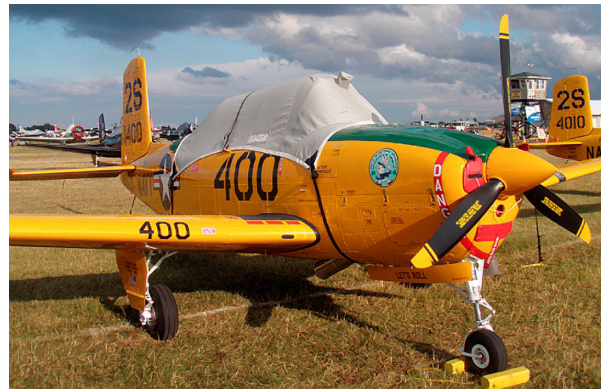
T34 Canopy Cover & Engine Inlet Plugs