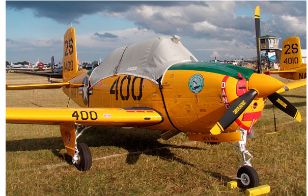
T34 Canopy Cover & Engine Inlet Plugs