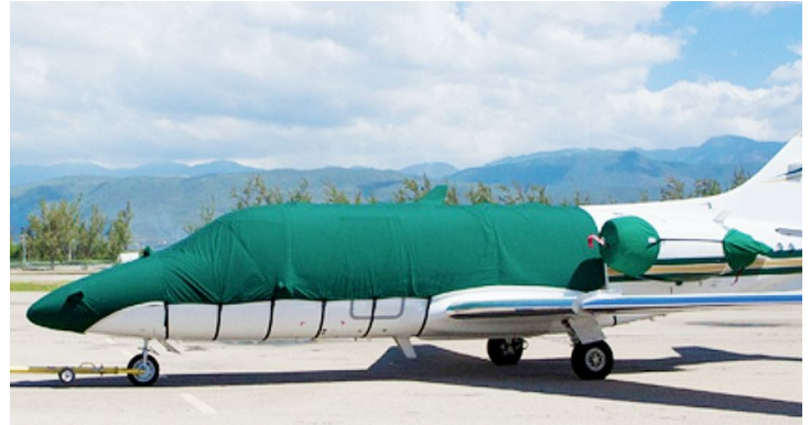
Raytheon Beechjet 400 Fuselage/Nose Cover, Engine Covers