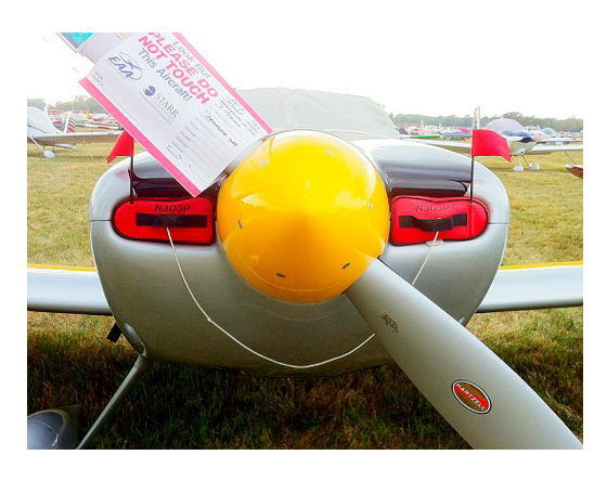
Vans's RV-7 Engine Engine Inlet Plugs