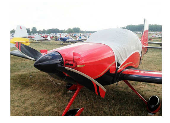
Van's RV-7 Canopy Cover & Engine Inlet Plugs