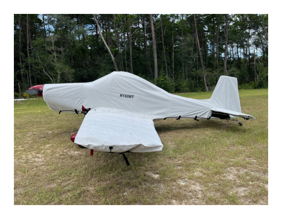
Bushby Mustang Complete Fuselage Cover with Detachable Wing Covers