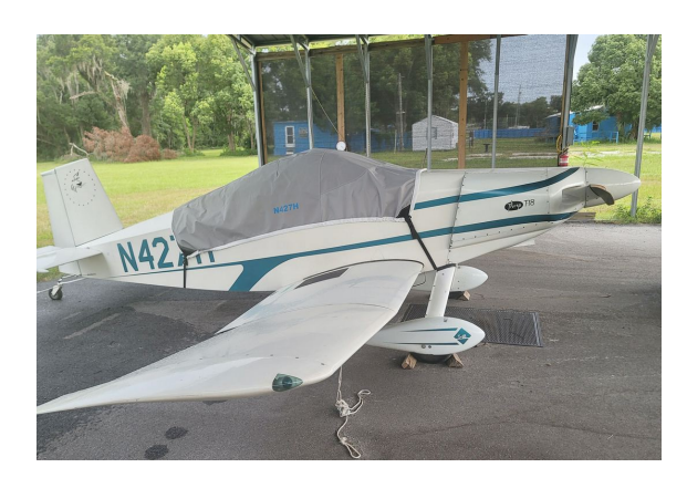
Thorp T-18 Travel Cover

Travel Covers are made with Silver Solution-Dyed Polyester fabric and only lined over the windshield to save weight. The material is lightweight and more compact for easy stowage in the aircraft. The polyester material is water resistant, but only intended for occasional use outside. We also have an ultra lightweight material available for fitted hangar dust covers. For daily outdoor use, the non-travel Sunbrella Cover is the best choice.