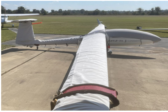
Pdps Pzl-Bielsko SZD-48-3