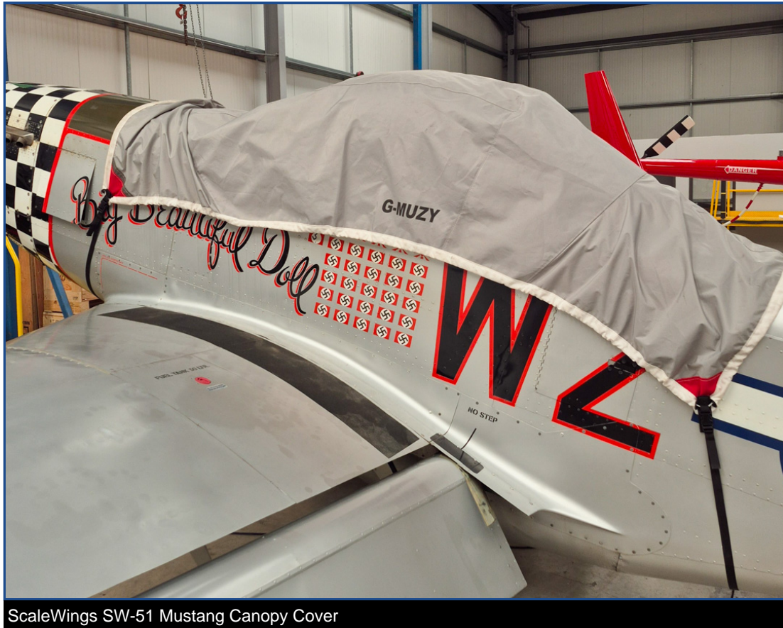
ScaleWings SW-51 Mustang Canopy Cover