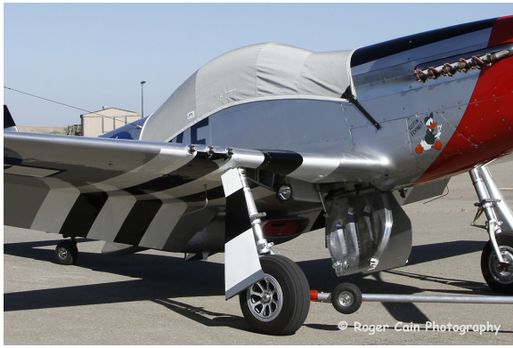
North American P-51 Canopy Cover