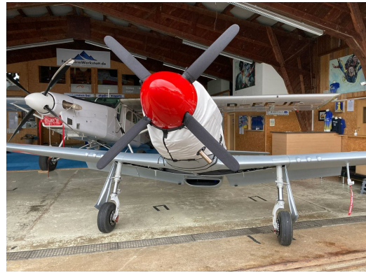
SW-51 Mustang Engine Cover