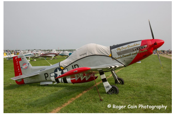
Titan Mustang Canopy Cover