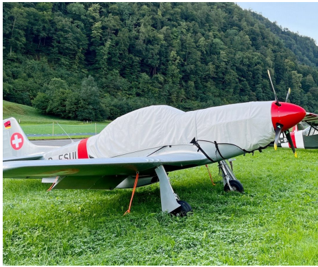
Stewart S-51 Canopy & Engine Covers

Covers developed this material combination especially for aircraft protection. The outer material is medium weight and treated for water resistance, UV resistance and anti-static buildup. The inner lining is a very soft and smooth microfiber to prevent scratching. The material is very reflective, and tests show that the cabin interior temperature can be reduced to near-ambient temperature on the hottest of days. It is water, ice and snow repellent, yet breathable to allow moisture to escape from between the cover and the aircraft surface.