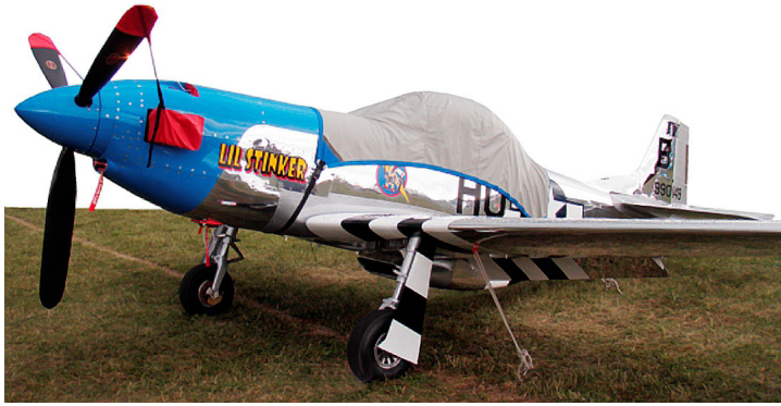
Stewart Mustang Canopy Cover, Prop Tie Downs & Intake Plugs

the hottest of days. It is water, ice and snow repellent, yet breathable to allow moisture to escape from between the cover and the aircraft surface.