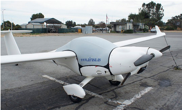
Lambda Travel Canopy Cover