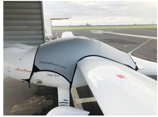
SUNDANCER Travel Cover with custom Imprint