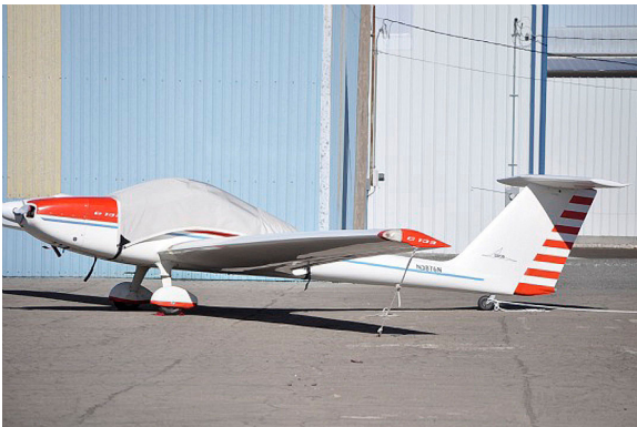
Grob 109 Canopy Cover