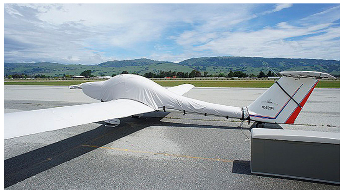
Grob 109 Canopy/Engine w/ extension to tail, Wing, Stabilizer & Prop/Spinner Covers