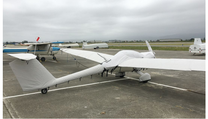
Distar Sundancer LSA Extended Canopy/Engine, Prop, Wheelpants, Wings & Empennage Covers