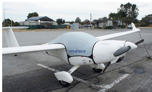
Lambda Travel Canopy Cover