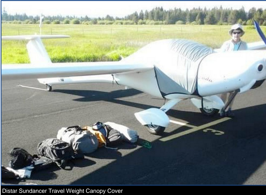
Distar Sundancer Travel Weight Canopy Cover