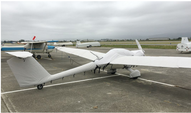
Distar Sundancer LSA Extended Canopy/Engine, Prop, Wheelpants, Wings & Empennage Covers