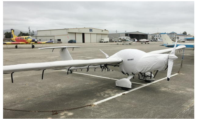
Distar Sundancer LSA Extended Canopy/Engine, Prop, Wheelpants, Wings & Empennage Covers