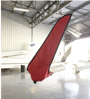
Schleicher ASH Wingtip Pads

Designed to prevent damage to the wingtip in crowded hangars or high traffic areas, these products are made of bright red Naugahyde and thickly padded with a sandwich of closed cell foam. Protects delicate winglets, casters and their housings, and soft finishes.