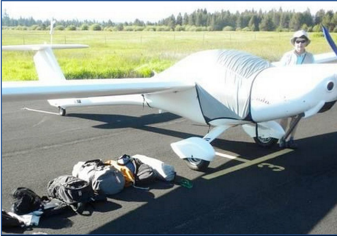
Distar Sundancer Travel Weight Canopy Cover