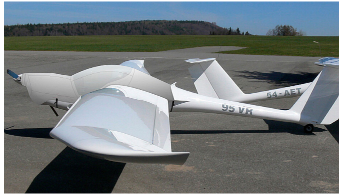
Lambda Canopy/Engine Cover (illustration)