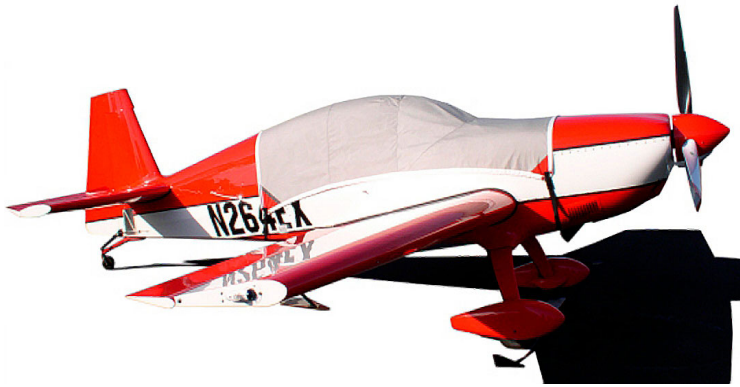
Canopy Cover for the Extra 300