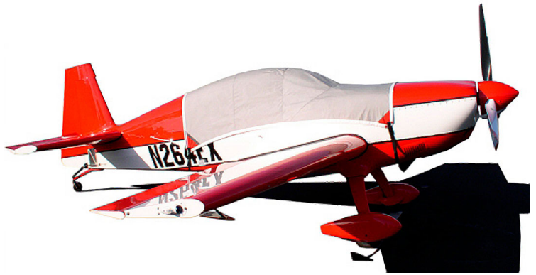
Canopy Cover for the Extra 300