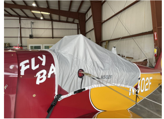
Bowers Fly Baby Canopy Cover