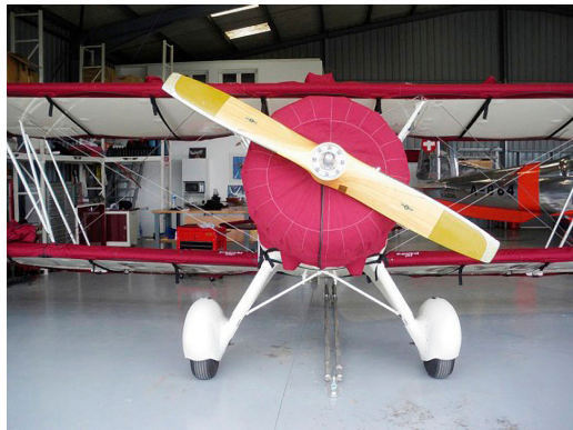
Waco UPF-7 Engine Cover

This cover type is made from Silver Acrylic Sunbrella canvas and is 100% lined with a soft and smooth microfiber. Bruce's Custom Covers developed this material combination especially for aircraft protection. The outer material is medium weight and treated for water resistance, UV resistance and anti-static buildup. The inner lining is a very soft and smooth microfiber to prevent scratching. The material is very reflective, and tests show that the cabin interior temperature can be reduced to near-ambient temperature on the hottest of days. It is water, ice and snow repellent, yet breathable to allow moisture to escape from between the cover and the aircraft surface.