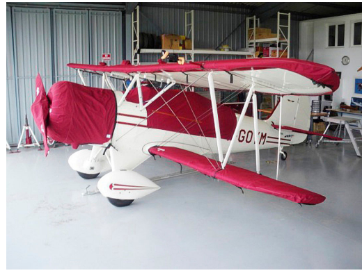
Waco UPF-7 Canopy, Wings, Stab's, Engine, Prop Covers