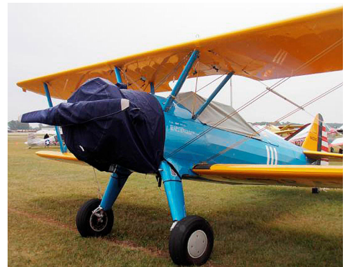
Stearman PT-13 Engine Cover