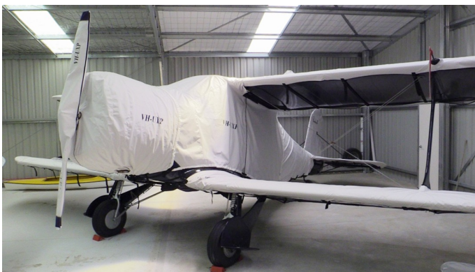
Beech Staggerwing Complete Cover Set

This cover type is made from Silver Acrylic Sunbrella canvas and is 100% lined with a soft and smooth microfiber. Bruce's Custom Covers developed this material combination especially for aircraft protection. The outer material is medium weight and treated for water resistance, UV resistance and anti-static buildup. The inner lining is a very soft and smooth microfiber to prevent scratching. The material is very reflective, and tests show that the cabin interior temperature can be reduced to near-ambient temperature on the hottest of days. It is water, ice and snow repellent, yet breathable to allow moisture to escape from between the cover and the aircraft surface.