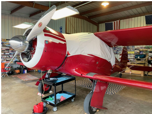
Beech Staggerwing D17S Canopy Cover

This cover type is made from Silver Acrylic Sunbrella canvas and is 100% lined with a soft and smooth microfiber. Bruce's Custom Covers developed this material combination especially for aircraft protection. The outer material is medium weight and treated for water resistance, UV resistance and anti-static buildup. The inner lining is a very soft and smooth microfiber to prevent scratching. The material is very reflective, and tests show that the cabin interior temperature can be reduced to near-ambient temperature on the hottest of days. It is water, ice and snow repellent, yet breathable to allow moisture to escape from between the cover and the aircraft surface.