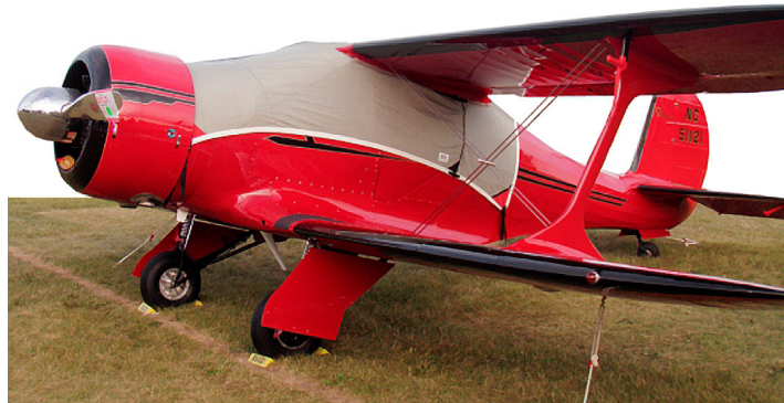
Beech Staggerwing Canopy Cover

Travel Covers are made with Silver Solution-Dyed Polyester fabric and only lined over the windshield to save weight. The material is lightweight and more compact for easy stowage in the aircraft. The polyester material is water resistant, but only intended for occasional use outside. We also have an ultra lightweight material available for fitted hangar dust covers. For daily outdoor use, the non-travel Sunbrella Cover is the best choice.