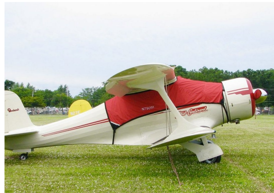
Beech Staggerwing Canopy Cover