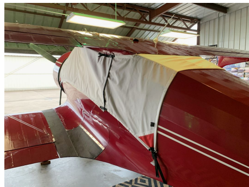
Beech Staggerwing D17S Canopy Cover