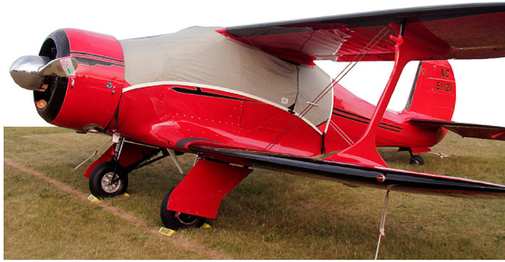
Beech Staggerwing Canopy Cover