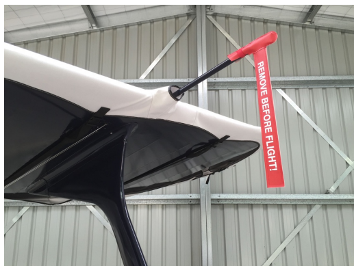
Beech Staggerwing Complete Cover Set, Upper Wing Detail

WINTER USE MATERIAL - Made with Solution-Dyed Polyester fabric, this option is intended for seasonal use to aid in deicing, rain mitigation, or for occasional travel. The material is lighter and more compact, but more susceptible to UV damage and may have a shorter useful life if used continuously outside than the all-year use material.