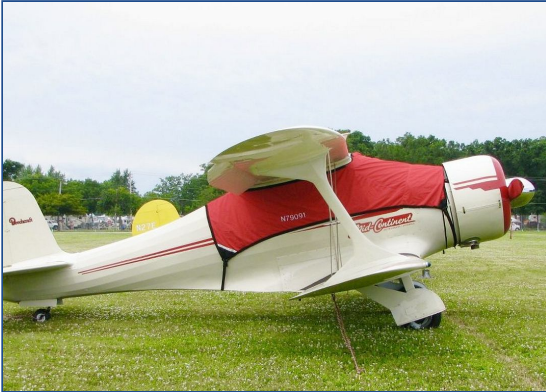
Beech Staggerwing Canopy Cover