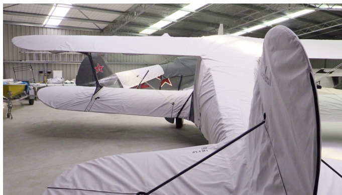
Beech Staggerwing Complete Cover Set