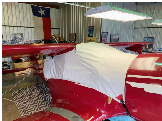
Beech Staggerwing D17S Canopy Cover

This cover type is made from Silver Acrylic Sunbrella canvas and is 100% lined with a soft and smooth microfiber. Bruce's Custom Covers developed this material combination especially for aircraft protection. The outer material is medium weight and treated for water resistance, UV resistance and anti-static buildup. The inner lining is a very soft and smooth microfiber to prevent scratching. The material is very reflective, and tests show that the cabin interior temperature can be reduced to near-ambient temperature on the hottest of days. It is water, ice and snow repellent, yet breathable to allow moisture to escape from between the cover and the aircraft surface.