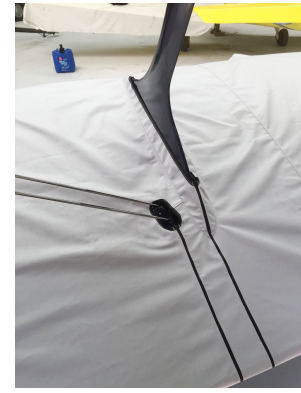
Beech Staggerwing Complete Cover Set, Lower Wing Detail