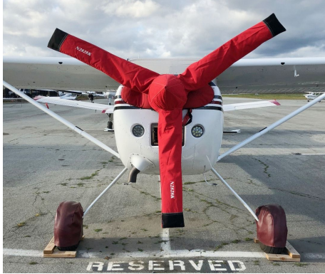
Cessna Skywagon Propellor/Spinner Cover, 3-blade type