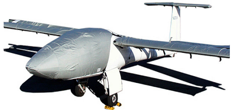
Stemme S-10 Wing Covers & Horiz. Stab. Covers