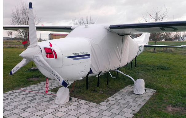
Cessna 210 Extended Canopy Cover, Engine Plugs, Prop and Tire Covers