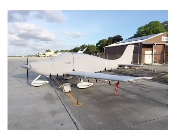
Cirrus SR-22 Full Cover Set