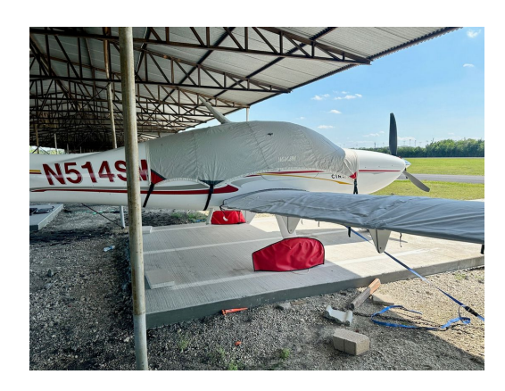
Cirrus SR-22 Canopy, Wing & Wheelpant Covers

Designed to prevent damage to the aircraft extremities in crowded hangars, these products are made of bright red Naugahyde and thickly padded with a sandwich of closed cell foam.