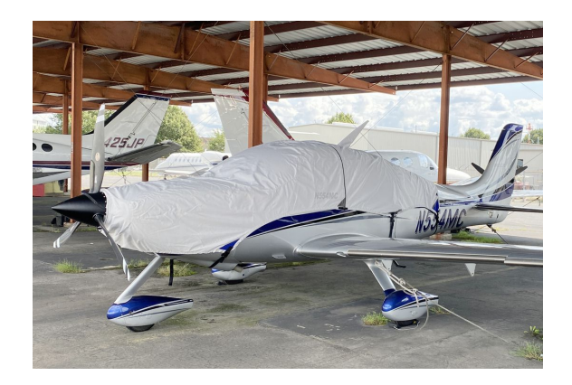
Cirrus SR22 Canopy/Engine Cover