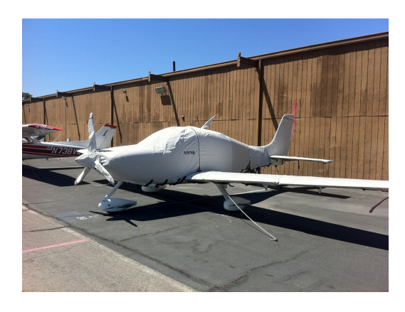
Cirrus SR-22 Full Cover Set