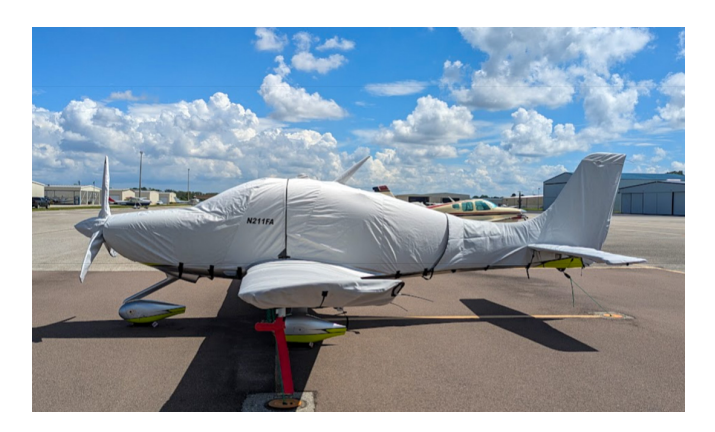
Cirrus SR-20 Complete Cover Set

WINTER USE MATERIAL - Made with Solution-Dyed Polyester fabric, this option is intended for seasonal use to aid in deicing, rain mitigation, or for occasional travel. The material is lighter and more compact, but more susceptible to UV damage and may have a shorter useful life if used continuously outside than the all-year use material.