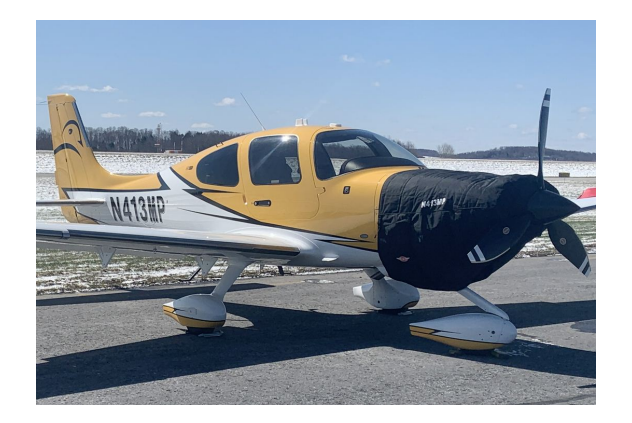
Cirrus SR22T Insulated Engine Cover