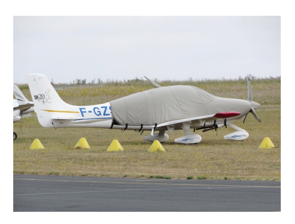
Cirrus SR-22 Extended Canopy/Engine Cover, Prop Cover, Wingtip Pads