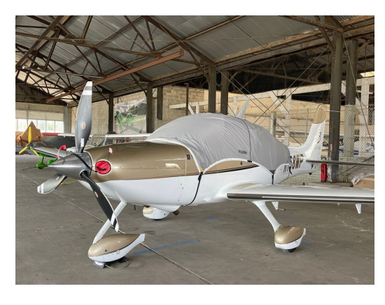
Cirrus SR-22 Travel Weight Canopy Cover