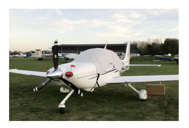
Cirrus SR20 G2 GTS Canopy Cover extended to cover parachute panel