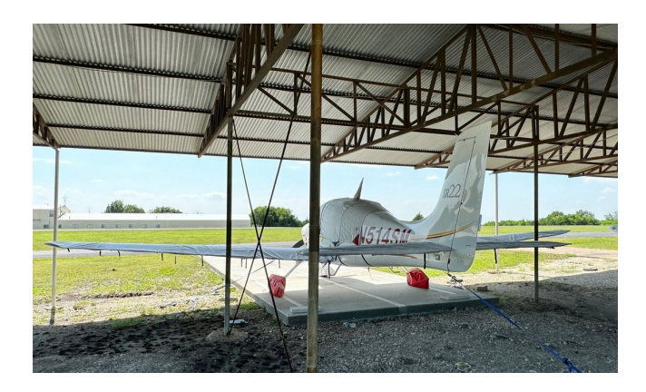
Cirrus SR-22 Canopy, Wing & Wheelpant Covers