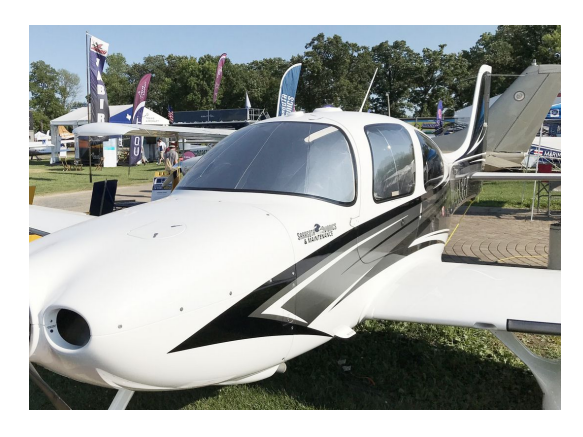
Cirrus SR-22 Cockpit HeatShields

Windshield Heatshields are interior sunshades for an aircraft's front windshield. The product is a unique composite of closed-cell foam with a silver mylar finish. The semi-rigid design is stiff enough to stand along the inside of the windshield using sun visors or window framing. It folds up flat and easily stores in the included storage sleeve. Some designs may require velcro and suction cups or split right and left sides. A Heatshield is an excellent short-term remedy for cockpit overheating. An external fabric cover is far more effective and practical for long-term protection.