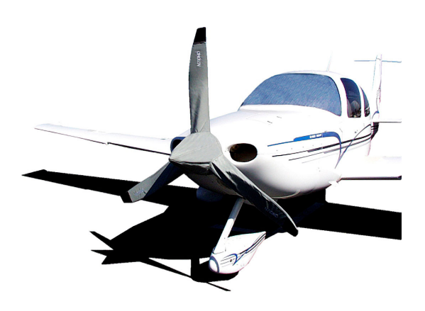
Cirrus SR-22 Propellor/Spinner Cover & Windshield Heatshield