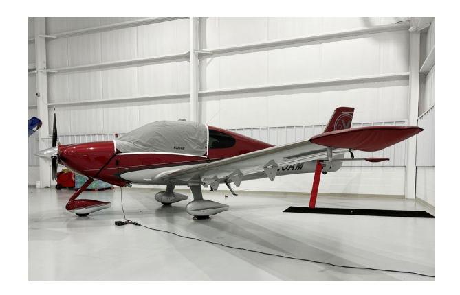
Cirrus SR-22 Cockpit Cover