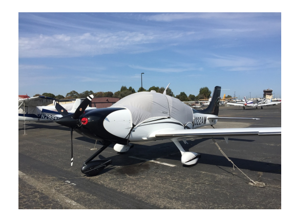
Cirrus SR-20/22 Travel Cover, Light Travel Canopy Cover

This cover type is made from Silver Acrylic Sunbrella canvas and is 100% lined with a soft and smooth microfiber. Bruce's Custom Covers developed this material combination especially for aircraft protection. The outer material is medium weight and treated for water resistance, UV resistance and anti-static buildup. The inner lining is a very soft and smooth microfiber to prevent scratching. The material is very reflective, and tests show that the cabin interior temperature can be reduced to near-ambient temperature on the hottest of days. It is water, ice and snow repellent, yet breathable to allow moisture to escape from between the cover and the aircraft surface.