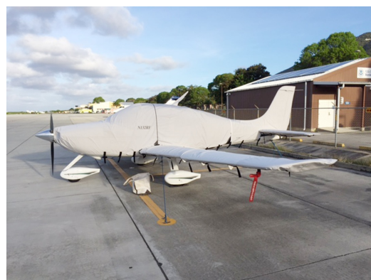
Cirrus SR-22 Full Cover Set

WINTER USE MATERIAL - Made with Solution-Dyed Polyester fabric, this option is intended for seasonal use to aid in deicing, rain mitigation, or for occasional travel. The material is lighter and more compact, but more susceptible to UV damage and may have a shorter useful life if used continuously outside than the all-year use material.