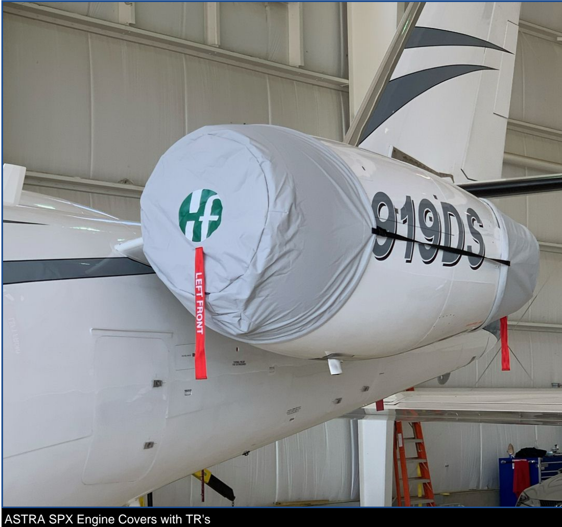
ASTRA SPX Engine Covers with TR's