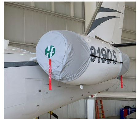
ASTRA SPX Engine Covers with TR's