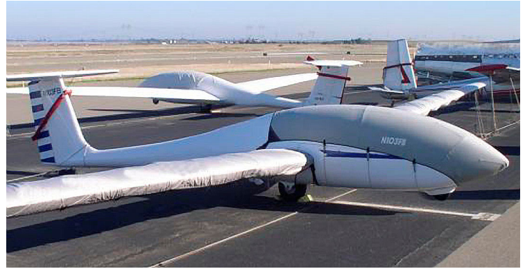
Grob 103 Canopy/Nose & Wing Covers