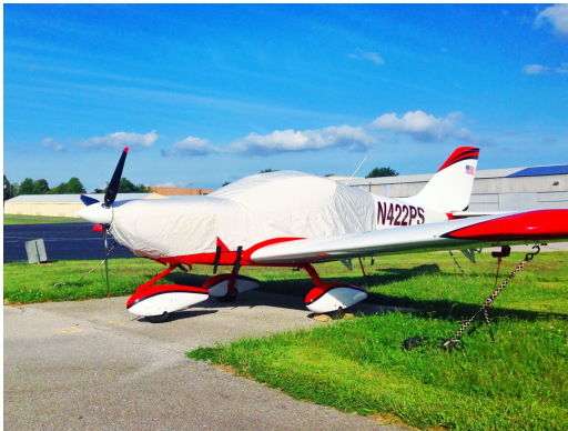
SportCruiser Canopy/Engine Cover

Travel Covers are made with Silver Solution-Dyed Polyester fabric and only lined over the windshield to save weight. The material is lightweight and more compact for easy stowage in the aircraft. The polyester material is water resistant, but only intended for occasional use outside. We also have an ultra lightweight material available for fitted hangar dust covers. For daily outdoor use, the non-travel Sunbrella Cover is the best choice.