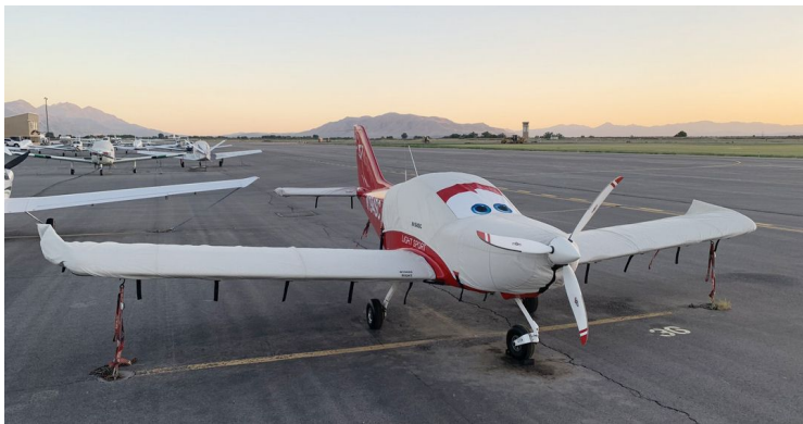
SportCruiser Canopy/Engine & Wing Covers

This cover type is made from Silver Acrylic Sunbrella canvas and is 100% lined with a soft and smooth microfiber. Bruce's Custom Covers developed this material combination especially for aircraft protection. The outer material is medium weight and treated for water resistance, UV resistance and anti-static buildup. The inner lining is a very soft and smooth microfiber to prevent scratching. The material is very reflective, and tests show that the cabin interior temperature can be reduced to near-ambient temperature on the hottest of days. It is water, ice and snow repellent, yet breathable to allow moisture to escape from between the cover and the aircraft surface.