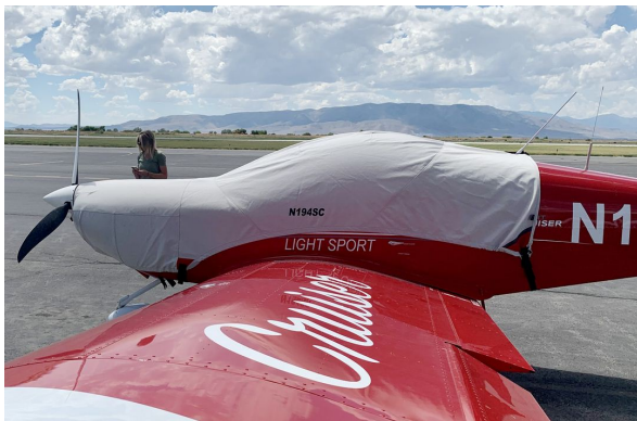
Sportcruiser Extended Canopy/Engine Cover

This cover type is made from Silver Acrylic Sunbrella canvas and is 100% lined with a soft and smooth microfiber. Bruce's Custom Covers developed this material combination especially for aircraft protection. The outer material is medium weight and treated for water resistance, UV resistance and anti-static buildup. The inner lining is a very soft and smooth microfiber to prevent scratching. The material is very reflective, and tests show that the cabin interior temperature can be reduced to near-ambient temperature on the hottest of days. It is water, ice and snow repellent, yet breathable to allow moisture to escape from between the cover and the aircraft surface.