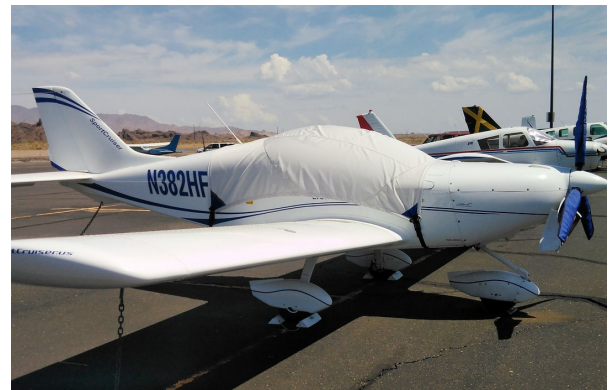
Czech Aircraft Works Sport Cruiser