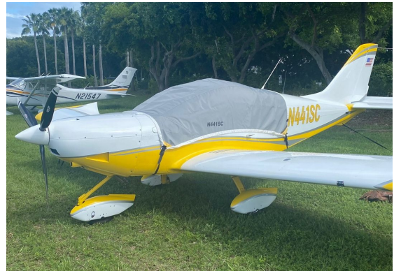
SportCruiser Travel Canopy Cover