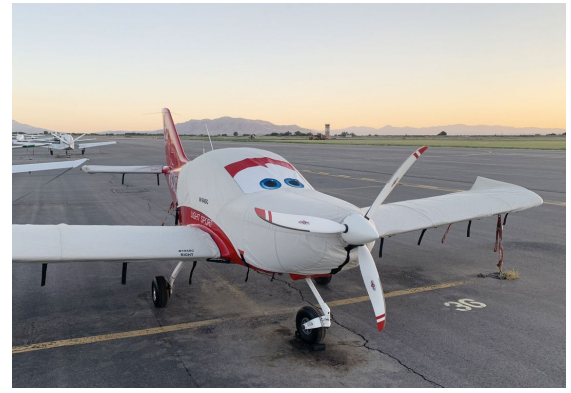
SportCruiser Canopy/Engine & Wing Covers