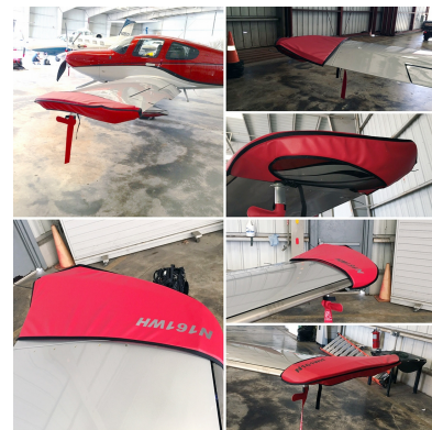
Cirrus SR22 Wingtip Pads, G5 Models