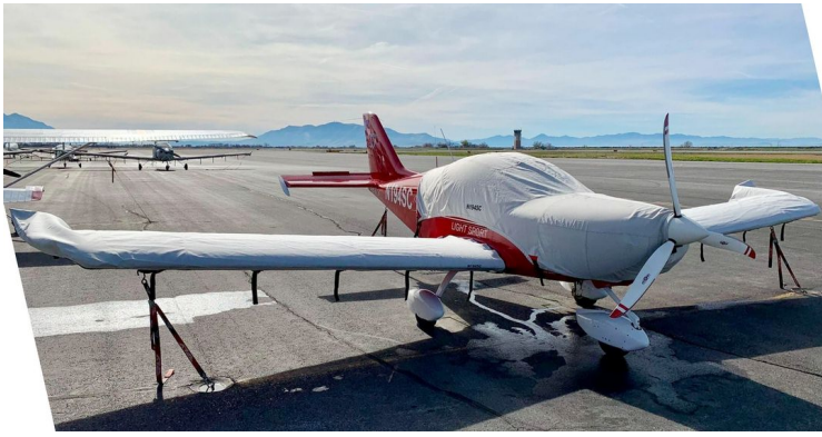
Czech Sport Canopy/Engine & Wing Covers