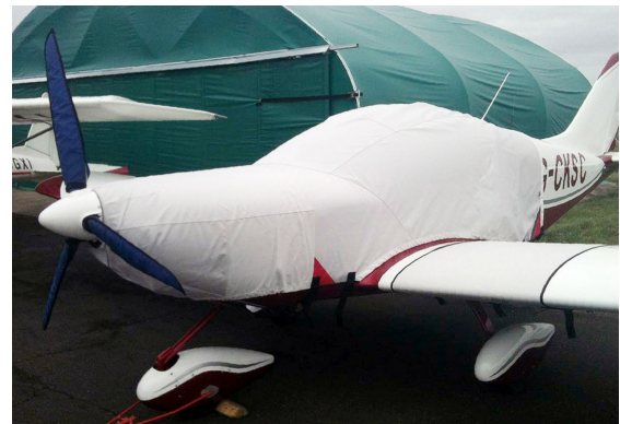
Czech Aircraft Works SportCruiser Canopy/Engine Cover