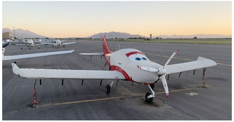
SportCruiser Canopy/Engine & Wing Covers