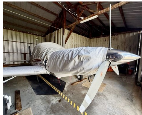
Micco SP20 Engine Cover