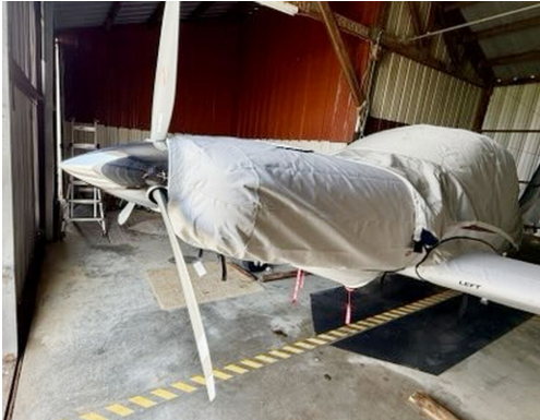
Micco SP20 Engine Cover

The Micco SP20 Canopy/Engine Cover is a one-piece cover (100% lined with microfiber) that is a combination of the Canopy Cover and Engine Cover. This cover will enclose the engine cowl and will extend aft to cover all of the windows. This cover type is made from Silver Acrylic Sunbrella canvas and is 100% lined with a soft and smooth microfiber. Bruce's Custom Covers developed this material combination especially for aircraft protection. The outer material is medium weight and treated for water resistance, UV resistance and anti-static buildup. The inner lining is a very soft and smooth microfiber to prevent scratching. The material is very reflective, and tests show that the cabin interior temperature can be reduced to near-ambient temperature on the hottest of days. It is water, ice and snow repellent, yet breathable to allow moisture to escape from between the cover and the aircraft surface.