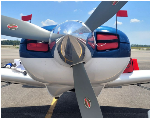
Micco SP20 Engine Inlet Plugs

Engine Inlet Plugs are custom fit for your Micco SP20 intakes, made with heavy-duty vinyl material, and stuffed with a single block of sculpted urethane foam. Each plug has a zipper that allows the foam to be removed and dried if necessary. Engine plugs have warning flags that are visible from the cockpit or 'remove before flight' streamers sewn onto the face of the plugs. Most plugs are imprinted with the aircraft registration number in black for an extra charge. Storage bag NOT included. Engine plugs may be inserted after flight when the engine is still warm. Engine Inlet Plugs are commonly referred to as Cowl Plugs, Intake Plugs, Cowl Blocks, Engine Blocks, and Engine Bungs.