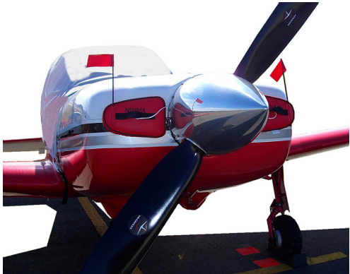
Micco SP20 Canopy Cover & Engine Inlet Plugs