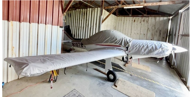
Micco SP20 Canopy Wing & Engine Covers