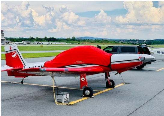
Micco SP20 Canopy Cover

The Micco SP20 Canopy/Engine Cover is a one-piece cover (100% lined with microfiber) that is a combination of the Canopy Cover and Engine Cover. This cover will enclose the engine cowl and will extend aft to cover all of the windows. This cover type is made from Silver Acrylic Sunbrella canvas and is 100% lined with a soft and smooth microfiber. Bruce's Custom Covers developed this material combination especially for aircraft protection. The outer material is medium weight and treated for water resistance, UV resistance and anti-static buildup. The inner lining is a very soft and smooth microfiber to prevent scratching. The material is very reflective, and tests show that the cabin interior temperature can be reduced to near-ambient temperature on the hottest of days. It is water, ice and snow repellent, yet breathable to allow moisture to escape from between the cover and the aircraft surface.