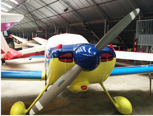
Van's RV-6 Engine Inlet Plugs

Engine Inlet Plugs are custom fit for your Sorrell Hiperbipe SNS-7 intakes, made with heavy-duty vinyl material, and stuffed with a single block of sculpted urethane foam. Each plug has a zipper that allows the foam to be removed and dried if necessary. Engine plugs have warning flags that are visible from the cockpit or 'remove before flight' streamers sewn onto the face of the plugs. Most plugs are imprinted with the aircraft registration number in black for an extra charge. Storage bag NOT included. Engine plugs may be inserted after flight when the engine is still warm. Engine Inlet Plugs are commonly referred to as Cowl Plugs, Intake Plugs, Cowl Blocks, Engine Blocks, and Engine Bungs.