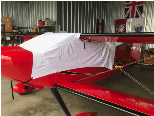
Sorrell Hiperbipe Canopy Cover (test fit cover)

Travel Covers are made with Silver Solution-Dyed Polyester fabric and only lined over the windshield to save weight. The material is lightweight and more compact for easy stowage in the aircraft. The polyester material is water resistant, but only intended for occasional use outside. We also have an ultra lightweight material available for fitted hangar dust covers. For daily outdoor use, the non-travel Sunbrella Cover is the best choice.