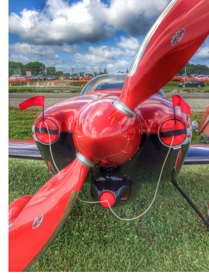
Van's RV-7 Engine Inlet Plugs