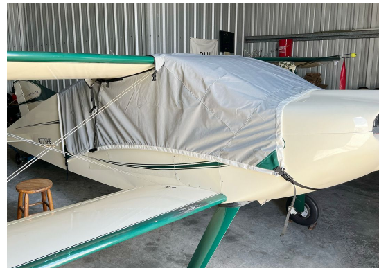
Sorrell SNS-7 Hiperbipe Over The Top Travel Canopy Cover