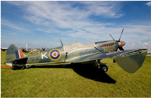
Supermarine Spitfire Mk IX Canopy Cover

Travel Covers are made with Silver Solution-Dyed Polyester fabric and only lined over the windshield to save weight. The material is lightweight and more compact for easy stowage in the aircraft. The polyester material is water resistant, but only intended for occasional use outside. We also have an ultra lightweight material available for fitted hangar dust covers. For daily outdoor use, the non-travel Sunbrella Cover is the best choice.