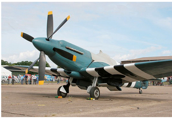
Supermarine Spitfire XIX Canopy Cover