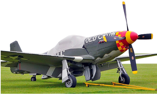
Canopy Cover, Chin Scoop & Exhaust Plugs