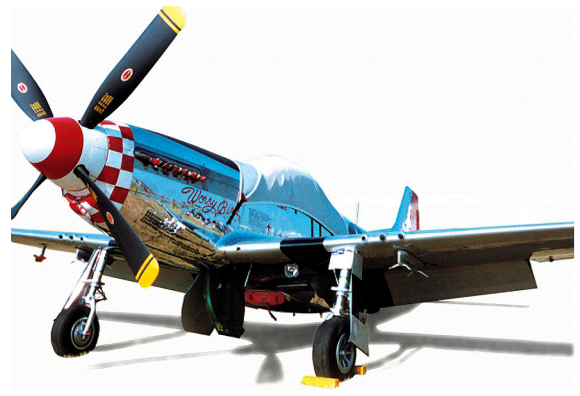
Canopy Cover, Belly & Chin Scoop Plugs