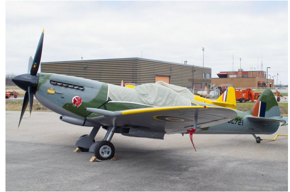
Supermarine Spitfire Mk 14 Canopy Cover