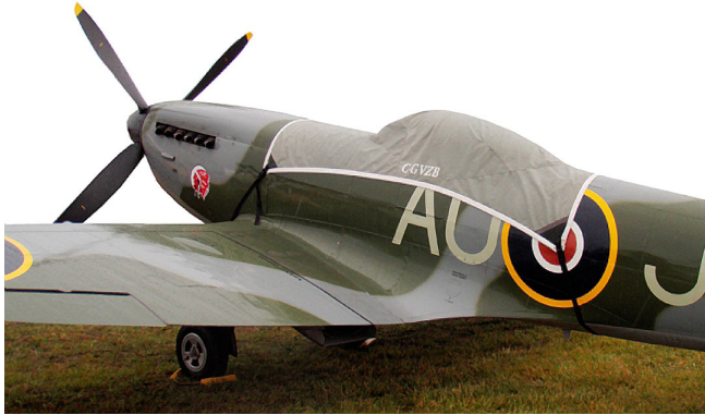
Supermarine Spitfire Mark 16 Canopy Cover

Travel Covers are made with Silver Solution-Dyed Polyester fabric and only lined over the windshield to save weight. The material is lightweight and more compact for easy stowage in the aircraft. The polyester material is water resistant, but only intended for occasional use outside. We also have an ultra lightweight material available for fitted hangar dust covers. For daily outdoor use, the non-travel Sunbrella Cover is the best choice.