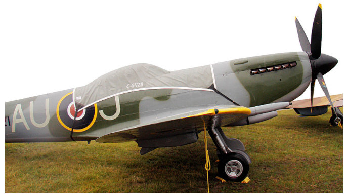
Supermarine Spitfire Mark 16 Canopy Cover