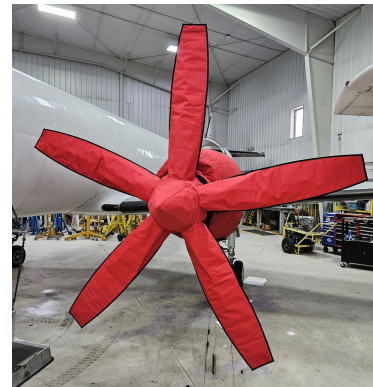
Fairchild Metro 5 Blade Insulated Insulated Prop Covers