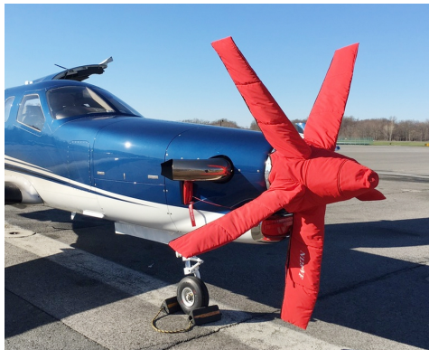
Socata TBM Insulated 5-Blade Prop/Spinner Cover

This cover type is made from Silver Acrylic Sunbrella canvas and is 100% lined with a soft and smooth microfiber. Bruce's Custom Covers developed this material combination especially for aircraft protection. The outer material is medium weight and treated for water resistance, UV resistance and anti-static buildup. The inner lining is a very soft and smooth microfiber to prevent scratching. The material is very reflective, and tests show that the cabin interior temperature can be reduced to near-ambient temperature on the hottest of days. It is water, ice and snow repellent, yet breathable to allow moisture to escape from between the cover and the aircraft surface.