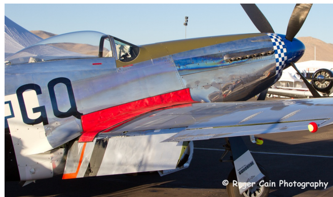
North American P-51 Wing Walk Pad