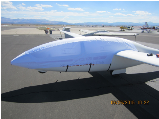
DG-505 Canopy/Nose Cover (test fit cover)