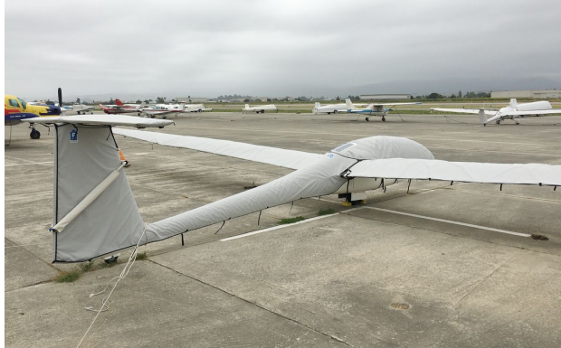
DG-505 Canopy/Nose, Wing, Empennage & Horiz. Stab. Covers

WINTER USE MATERIAL - Made with Solution-Dyed Polyester fabric, this option is intended for seasonal use to aid in deicing, rain mitigation, or for occasional travel. The material is lighter and more compact, but more susceptible to UV damage and may have a shorter useful life if used continuously outside than the all-year use material.