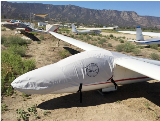
Pilatus B4 Canopy/Nose Cover