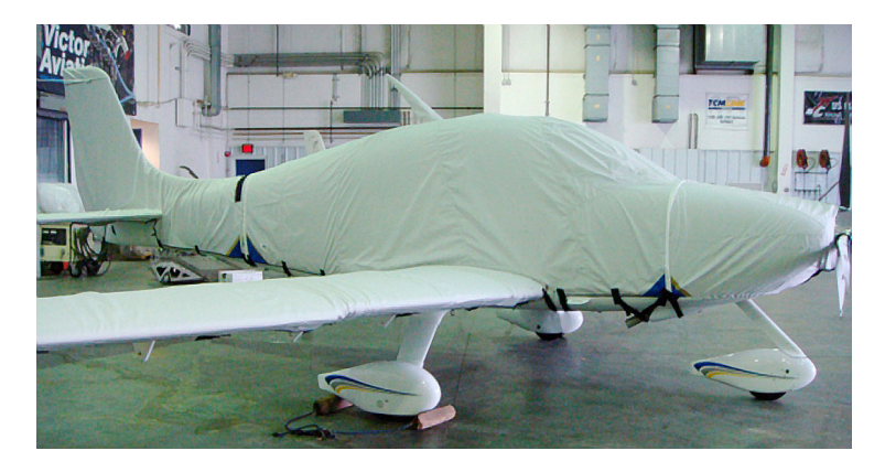
Cirrus SR20 Full Cover Set (Extended Canopy Cover, Engine Cover, Wing Covers, Empennage Cover)

This cover type is made from Silver Acrylic Sunbrella canvas and is 100% lined with a soft and smooth microfiber. Bruce's Custom Covers developed this material combination especially for aircraft protection. The outer material is medium weight and treated for water resistance, UV resistance and anti-static buildup. The inner lining is a very soft and smooth microfiber to prevent scratching. The material is very reflective, and tests show that the cabin interior temperature can be reduced to near-ambient temperature on the hottest of days. It is water, ice and snow repellent, yet breathable to allow moisture to escape from between the cover and the aircraft surface.