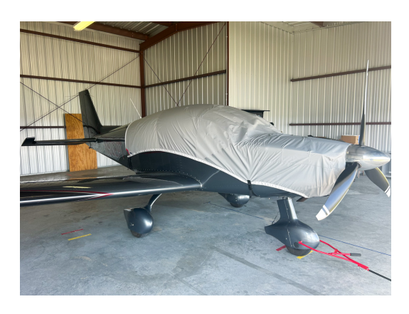
Sling TSI Travel Cover, Light Weight Canopy/Engine Cover