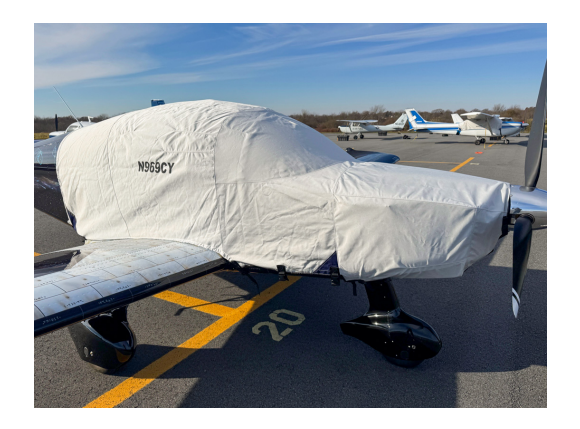
Sling TSi Extended Canopy/Engine Cover

This cover type is made from Silver Acrylic Sunbrella canvas and is 100% lined with a soft and smooth microfiber. Bruce's Custom Covers developed this material combination especially for aircraft protection. The outer material is medium weight and treated for water resistance, UV resistance and anti-static buildup. The inner lining is a very soft and smooth microfiber to prevent scratching. The material is very reflective, and tests show that the cabin interior temperature can be reduced to near-ambient temperature on the hottest of days. It is water, ice and snow repellent, yet breathable to allow moisture to escape from between the cover and the aircraft surface.