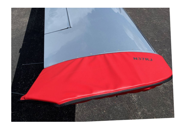
Cirrus SR-22 Wingtip Pads