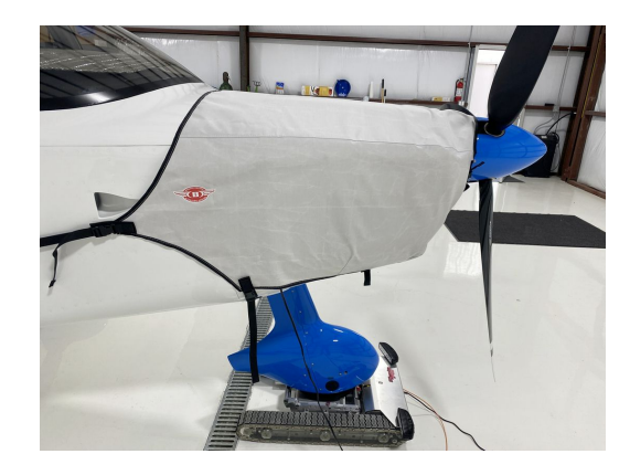
Sling TSI Engine Cover