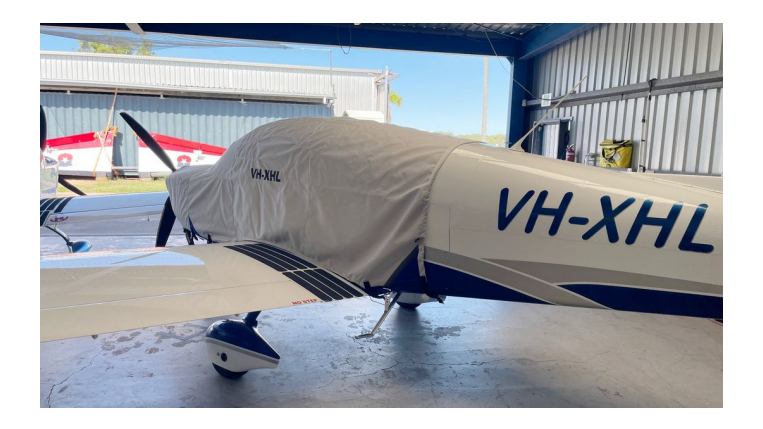
Sling TSI Extended Canopy/Engine Cover