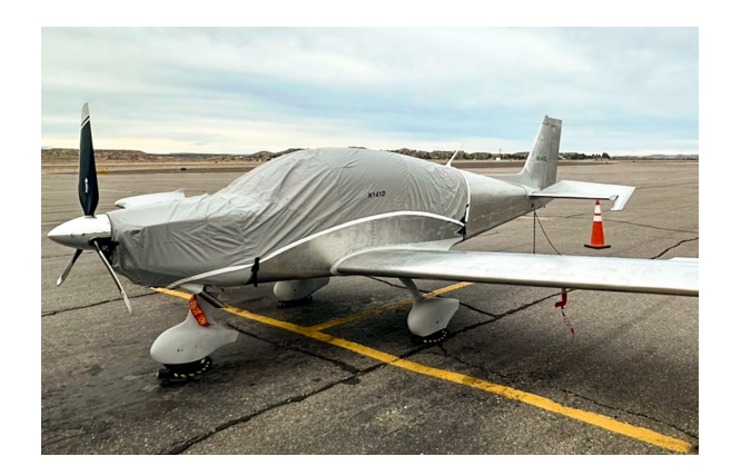
Sling TSi Travel Weight Canopy/Engine Cover

Travel Covers are made with Silver Solution-Dyed Polyester fabric and only lined over the windshield to save weight. The material is lightweight and more compact for easy stowage in the aircraft. The polyester material is water resistant, but only intended for occasional use outside. We also have an ultra lightweight material available for fitted hangar dust covers. For daily outdoor use, the non-travel Sunbrella Cover is the best choice.