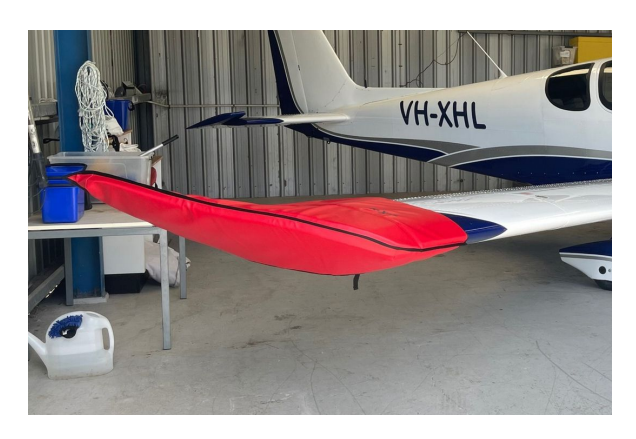
Sling TSI Wingtip Pads