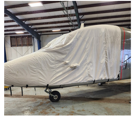
Short Brothers Sherpa, Skyvan, 330 & 360 (C-23) Forward Fuselage/Nose Cover Short Skyvan Forward Fuselage/Nose Cover