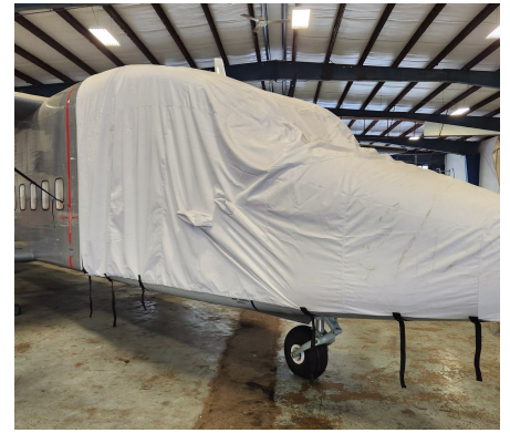
Short Brothers Sherpa, Skyvan, 330 & 360 (C-23) Forward Fuselage/Nose Cover Short Skyvan Forward Fuselage/Nose Cover