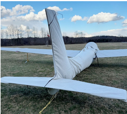
Schweizer SGS 2-32 Complete Cover Set