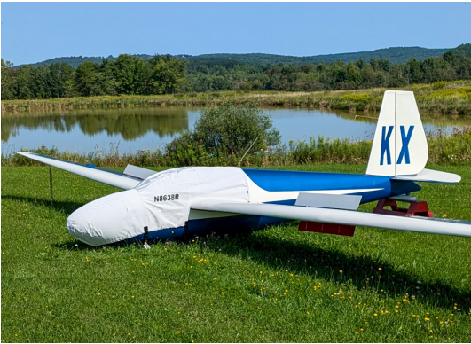
Schweizer 1-23H-15 Canopy/Nose Cover