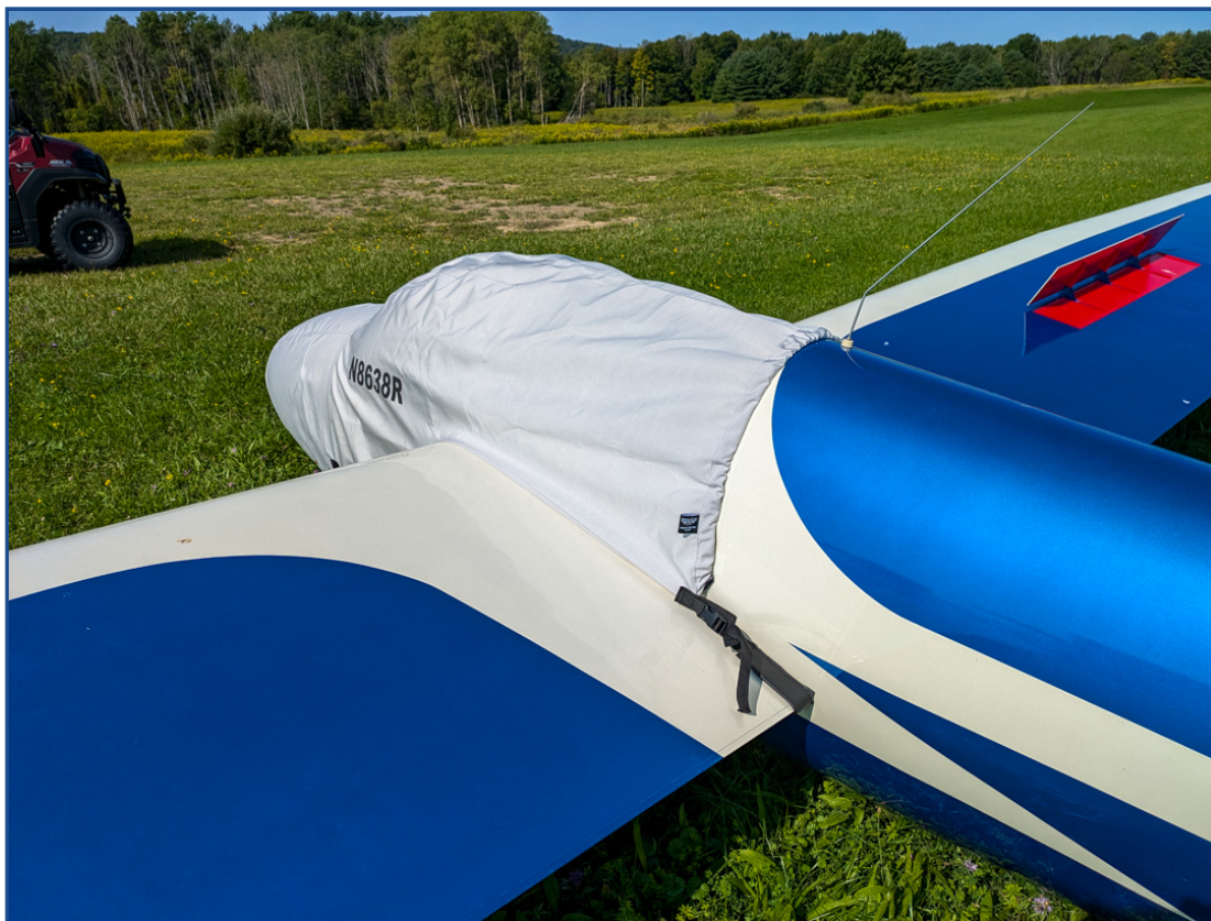
Schweizer 1-23H-15 Canopy/Nose Cover