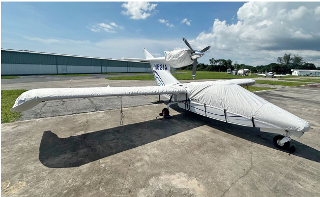
Seawind 3000 Canopy/Nose, Wing & Engine Covers