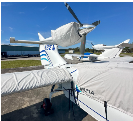
Seawind Seawind 300C & 3000 Amphibian Wing Covers, All Year Use

This cover type is made from Silver Acrylic Sunbrella canvas and is 100% lined with a soft and smooth microfiber. Bruce's Custom Covers developed this material combination especially for aircraft protection. The outer material is medium weight and treated for water resistance, UV resistance and anti-static buildup. The inner lining is a very soft and smooth microfiber to prevent scratching. The material is very reflective, and tests show that the cabin interior temperature can be reduced to near-ambient temperature on the hottest of days. It is water, ice and snow repellent, yet breathable to allow moisture to escape from between the cover and the aircraft surface.