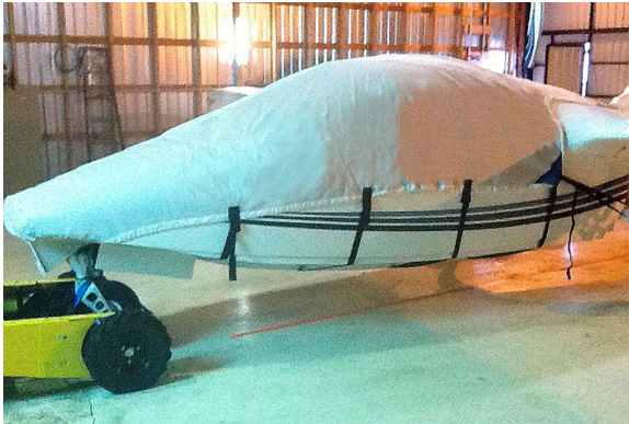
Seawind Canopy/Nose Cover

This cover type is made from Silver Acrylic Sunbrella canvas and is 100% lined with a soft and smooth microfiber. Bruce's Custom Covers developed this material combination especially for aircraft protection. The outer material is medium weight and treated for water resistance, UV resistance and anti-static buildup. The inner lining is a very soft and smooth microfiber to prevent scratching. The material is very reflective, and tests show that the cabin interior temperature can be reduced to near-ambient temperature on the hottest of days. It is water, ice and snow repellent, yet breathable to allow moisture to escape from between the cover and the aircraft surface.