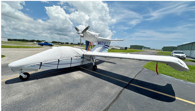
Seawind 3000 Canopy/Nose, Wing & Engine Covers

This cover type is made from Silver Acrylic Sunbrella canvas and is 100% lined with a soft and smooth microfiber. Bruce's Custom Covers developed this material combination especially for aircraft protection. The outer material is medium weight and treated for water resistance, UV resistance and anti-static buildup. The inner lining is a very soft and smooth microfiber to prevent scratching. The material is very reflective, and tests show that the cabin interior temperature can be reduced to near-ambient temperature on the hottest of days. It is water, ice and snow repellent, yet breathable to allow moisture to escape from between the cover and the aircraft surface.