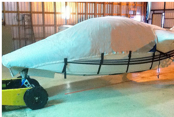
Seawind Canopy/Nose Cover

This cover type is made from Silver Acrylic Sunbrella canvas and is 100% lined with a soft and smooth microfiber. Bruce's Custom Covers developed this material combination especially for aircraft protection. The outer material is medium weight and treated for water resistance, UV resistance and anti-static buildup. The inner lining is a very soft and smooth microfiber to prevent scratching. The material is very reflective, and tests show that the cabin interior temperature can be reduced to near-ambient temperature on the hottest of days. It is water, ice and snow repellent, yet breathable to allow moisture to escape from between the cover and the aircraft surface.