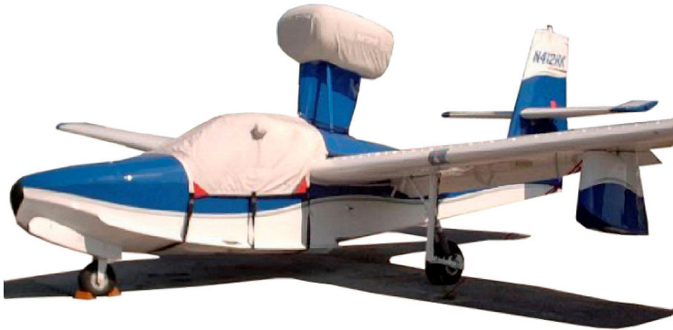
Lake Canopy & Engine Covers