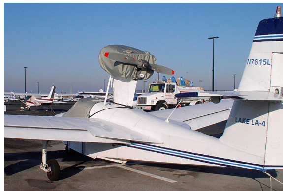
Lake Canopy & Engine Covers