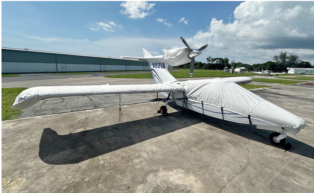
Seawind 3000 Canopy/Nose, Wing & Engine Covers

This cover type is made from Silver Acrylic Sunbrella canvas and is 100% lined with a soft and smooth microfiber. Bruce's Custom Covers developed this material combination especially for aircraft protection. The outer material is medium weight and treated for water resistance, UV resistance and anti-static buildup. The inner lining is a very soft and smooth microfiber to prevent scratching. The material is very reflective, and tests show that the cabin interior temperature can be reduced to near-ambient temperature on the hottest of days. It is water, ice and snow repellent, yet breathable to allow moisture to escape from between the cover and the aircraft surface.