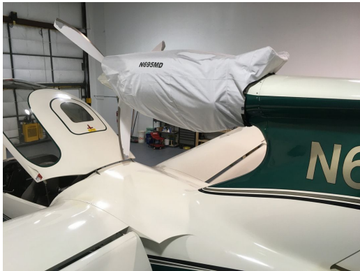
Seawind 3000 Custom Engine Cover