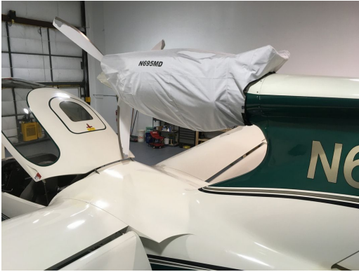
Seawind 3000 Custom Engine Cover

This cover type is made from Silver Acrylic Sunbrella canvas and is 100% lined with a soft and smooth microfiber. Bruce's Custom Covers developed this material combination especially for aircraft protection. The outer material is medium weight and treated for water resistance, UV resistance and anti-static buildup. The inner lining is a very soft and smooth microfiber to prevent scratching. The material is very reflective, and tests show that the cabin interior temperature can be reduced to near-ambient temperature on the hottest of days. It is water, ice and snow repellent, yet breathable to allow moisture to escape from between the cover and the aircraft surface.