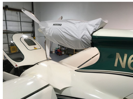
Seawind 3000 Custom Engine Cover