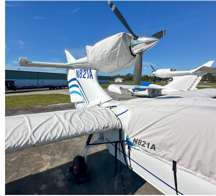
Seawind Seawind 300C & 3000 Amphibian Wing Covers, All Year Use