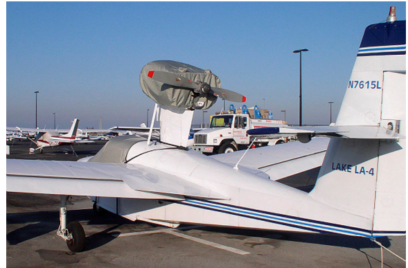
Lake Canopy & Engine Covers