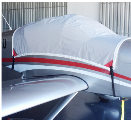
Vans's RV-9 Light Weight Travel Canopy Cover

This cover type is made from Silver Acrylic Sunbrella canvas and is 100% lined with a soft and smooth microfiber. Bruce's Custom Covers developed this material combination especially for aircraft protection. The outer material is medium weight and treated for water resistance, UV resistance and anti-static buildup. The inner lining is a very soft and smooth microfiber to prevent scratching. The material is very reflective, and tests show that the cabin interior temperature can be reduced to near-ambient temperature on the hottest of days. It is water, ice and snow repellent, yet breathable to allow moisture to escape from between the cover and the aircraft surface.