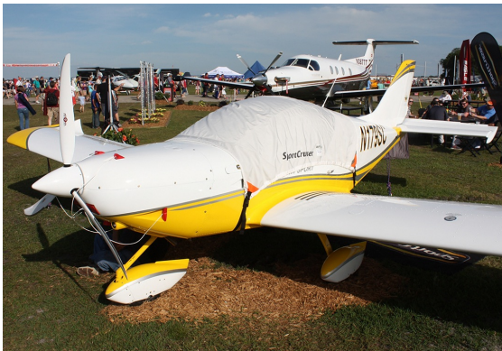
PiperSport Canopy Cover, Engine Plugs