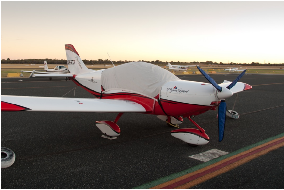
PiperSport Canopy Cover, Engine Plugs