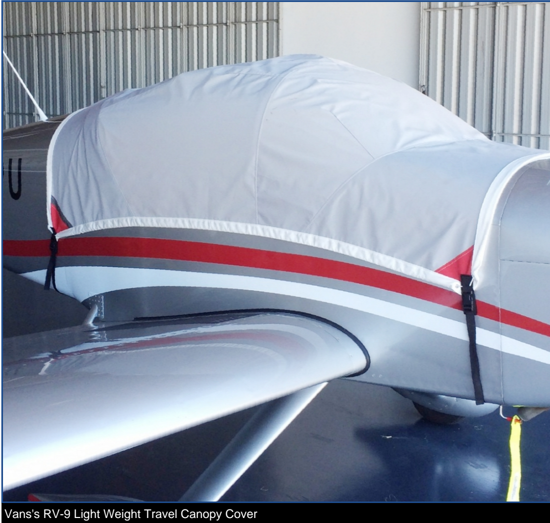
Vans's RV-9 Light Weight Travel Canopy Cover