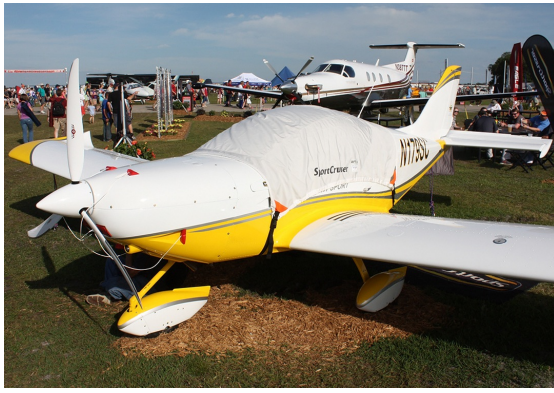
PiperSport Canopy Cover, Engine Plugs