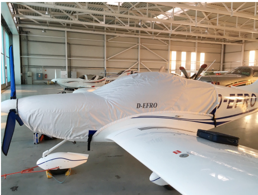
SportCruiser Canopy/Engine Cover

This cover type is made from Silver Acrylic Sunbrella canvas and is 100% lined with a soft and smooth microfiber. Bruce's Custom Covers developed this material combination especially for aircraft protection. The outer material is medium weight and treated for water resistance, UV resistance and anti-static buildup. The inner lining is a very soft and smooth microfiber to prevent scratching. The material is very reflective, and tests show that the cabin interior temperature can be reduced to near-ambient temperature on the hottest of days. It is water, ice and snow repellent, yet breathable to allow moisture to escape from between the cover and the aircraft surface.