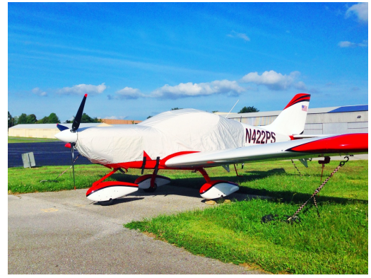
SportCruiser Canopy/Engine Cover