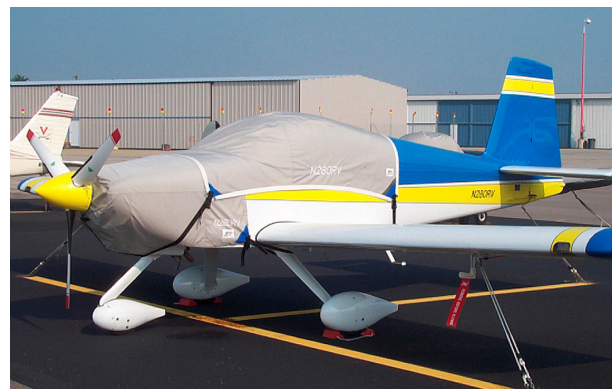
Van's RV-9 Canopy & Engine Covers