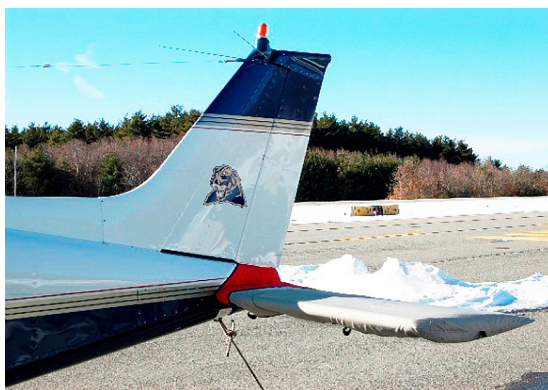
Tailcone & Horizontal Stabilizer Covers