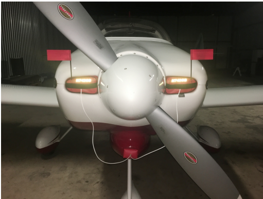
Van's Aircraft RV-7A Engine Inlet Plugs

Engine Inlet Plugs are custom fit for your Tomark Aero Viper SD4 intakes, made with heavy-duty vinyl material, and stuffed with a single block of sculpted urethane foam. Each plug has a zipper that allows the foam to be removed and dried if necessary. Engine plugs have warning flags that are visible from the cockpit or 'remove before flight' streamers sewn onto the face of the plugs. Most plugs are imprinted with the aircraft registration number in black for an extra charge. Storage bag NOT included. Engine plugs may be inserted after flight when the engine is still warm. Engine Inlet Plugs are commonly referred to as Cowl Plugs, Intake Plugs, Cowl Blocks, Engine Blocks, and Engine Bungs.