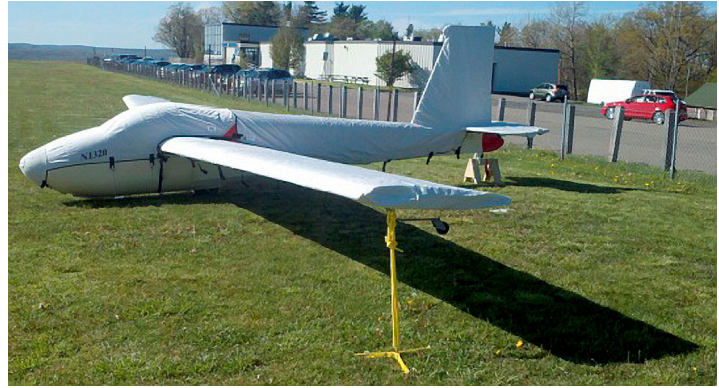
SGS 1-26B Canopy/Nose, Empennage & Wing Covers