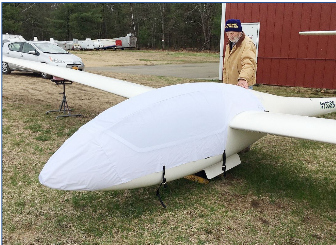
Grob 102 Astir CS Canopy/Nose Cover (test fit)