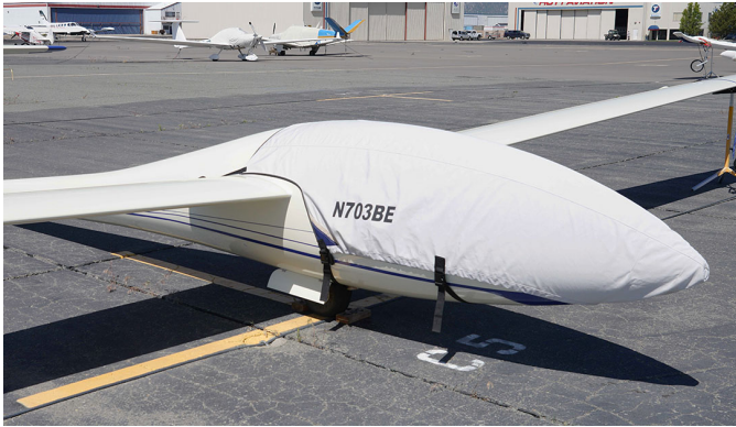
Schempp-Hirth Ventus C Canopy/Nose Cover

The material is very reflective, and tests show that the cabin interior temperature can be reduced to near-ambient temperature on the hottest of days. It is water, ice and snow repellent, yet breathable to allow moisture to escape from between the cover and the aircraft surface.