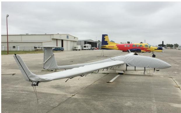
DG-505 Canopy/Nose, Wing, Empennage & Horiz. Stab. Covers

WINTER USE MATERIAL - Made with Solution-Dyed Polyester fabric, this option is intended for seasonal use to aid in deicing, rain mitigation, or for occasional travel. The material is lighter and more compact, but more susceptible to UV damage and may have a shorter useful life if used continuously outside than the all-year use material.