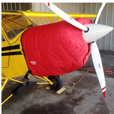
Zlin Savage Insulated Engine Cover

This cover type is made from Silver Acrylic Sunbrella canvas and is 100% lined with a soft and smooth microfiber. Bruce's Custom Covers developed this material combination especially for aircraft protection. The outer material is medium weight and treated for water resistance, UV resistance and anti-static buildup. The inner lining is a very soft and smooth microfiber to prevent scratching. The material is very reflective, and tests show that the cabin interior temperature can be reduced to near-ambient temperature on the hottest of days. It is water, ice and snow repellent, yet breathable to allow moisture to escape from between the cover and the aircraft surface.