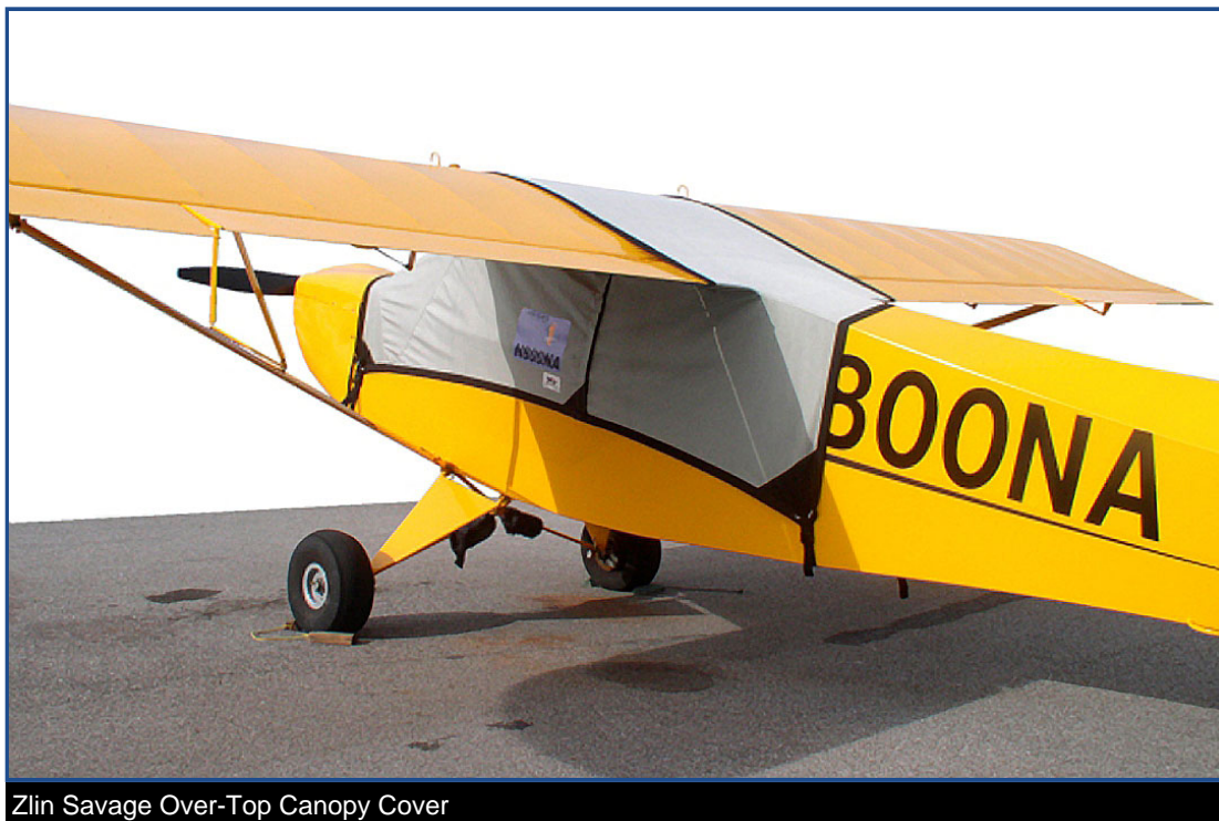
Zlin Savage Over-Top Canopy Cover