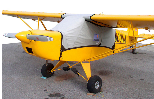
Zlin Savage Canopy Cover

This cover type is made from Silver Acrylic Sunbrella canvas and is 100% lined with a soft and smooth microfiber. Bruce's Custom Covers developed this material combination especially for aircraft protection. The outer material is medium weight and treated for water resistance, UV resistance and anti-static buildup. The inner lining is a very soft and smooth microfiber to prevent scratching. The material is very reflective, and tests show that the cabin interior temperature can be reduced to near-ambient temperature on the hottest of days. It is water, ice and snow repellent, yet breathable to allow moisture to escape from between the cover and the aircraft surface.