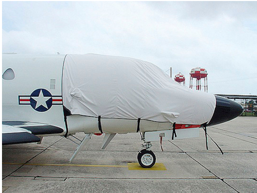
Sabre 40 Cockpit Cover