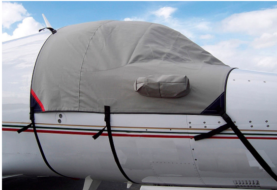
Sabre Cockpit Cover

This cover type is made from Silver Acrylic Sunbrella canvas and is 100% lined with a soft and smooth microfiber. Bruce's Custom Covers developed this material combination especially for aircraft protection. The outer material is medium weight and treated for water resistance, UV resistance and anti-static buildup. The inner lining is a very soft and smooth microfiber to prevent scratching. The material is very reflective, and tests show that the cabin interior temperature can be reduced to near-ambient temperature on the hottest of days. It is water, ice and snow repellent, yet breathable to allow moisture to escape from between the cover and the aircraft surface.