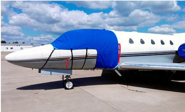
Rockwell Sabre Cockpit/Door Cover

This cover type is made from Silver Acrylic Sunbrella canvas and is 100% lined with a soft and smooth microfiber. Bruce's Custom Covers developed this material combination especially for aircraft protection. The outer material is medium weight and treated for water resistance, UV resistance and anti-static buildup. The inner lining is a very soft and smooth microfiber to prevent scratching. The material is very reflective, and tests show that the cabin interior temperature can be reduced to near-ambient temperature on the hottest of days. It is water, ice and snow repellent, yet breathable to allow moisture to escape from between the cover and the aircraft surface.