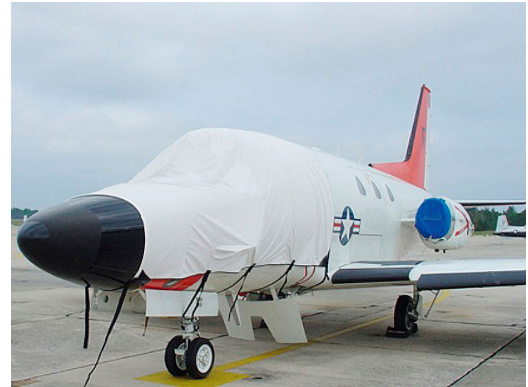
Sabre 40 Cockpit and Engine Covers set