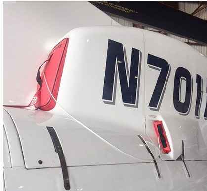
Sikorsky S76 (All Models) Intake Plugs (S76c Models)

The Engine Inlet Plugs are custom fit for your Sikorsky S76 (All Models) intakes, made with heavy-duty vinyl material, and stuffed with a single block of sculpted urethane foam. Each plug has a zipper that allows the foam to be removed and dried if necessary. Engine plugs have 'Remove Before Flight' streamers sewn onto the face of the plugs. Most plugs are imprinted with the aircraft registration number in black for an extra charge. Storage bag NOT included. Engine plugs may be inserted after flight when the engine is still warm. Engine Inlet Plugs are commonly referred to as Cowl Plugs, Intake Plugs, Cowl Blocks, Engine Blocks, and Engine Bungs.