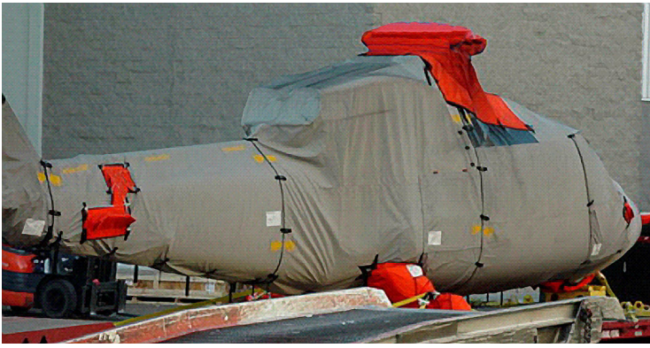
S76 Full Body Transport Cover