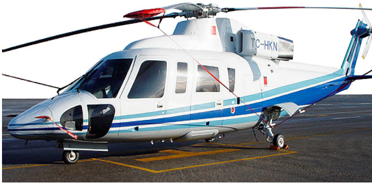
S76 Blade Tie-Downs and Pitot Cover set