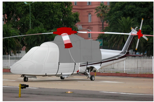
S76 Forward Fuselage, Engine, Main & Tail Rotor Hub Covers (illustration)