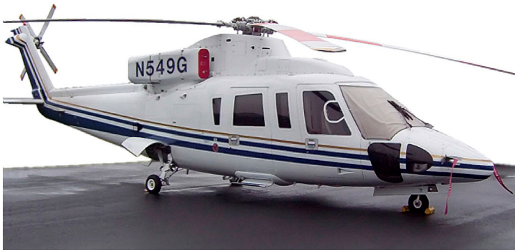
Sikorsky S76 Snap-On Windshield Cover