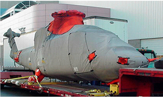
S76 Full Body Transport Cover