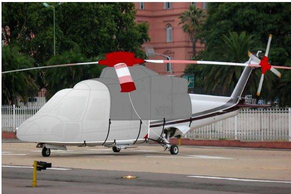
S76 Forward Fuselage, Engine, Main & Tail Rotor Hub Covers (illustration)