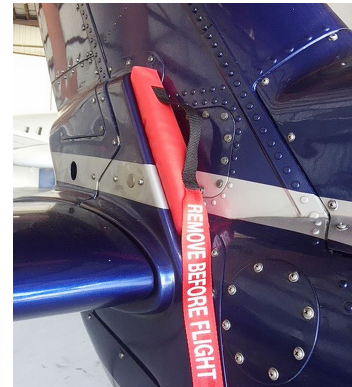
S76 Tail Wedge Plug