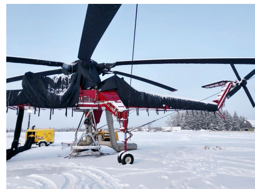
Sikorsky S-64 Skycrane, CH-54 Tarhe Insulated Engine, Rotor Hub, Tailboom, Stabilizer & Tail Rotor Covers