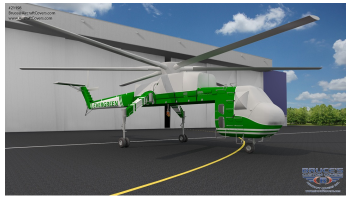
Sikorsky S-64 Canopy/Nose, Engine Area, Blade, Rotor, Tail Rotor Covers (illustration)