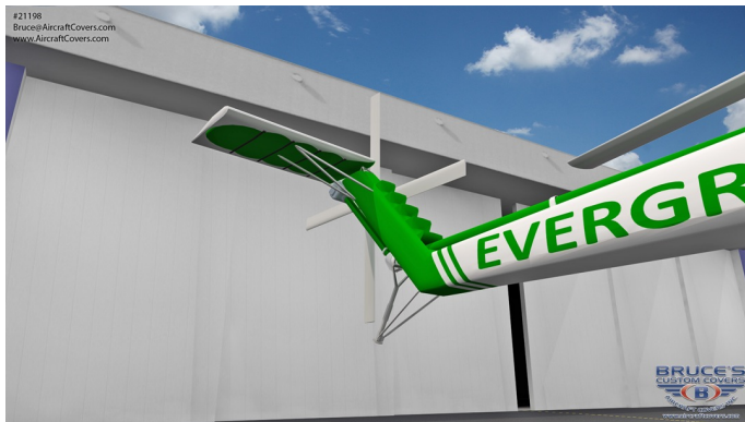
Sikorsky S-64 Canopy/Nose, Engine Area, Blade, Rotor, Tail Rotor Covers (illustration)

The Tailboom Cover details vary by model, but generally the helicopter tail boom cover encloses the tail boom from the "bottleneck" to the aft end. They usually also cover the horizontal stabilizers, and are custom made to allow for antennae, lights, and other protrusions. They attach with straps underneath the tail boom. Covers for the vertical and horizontal stabilizers are also available separately. Specific information for each model is available on request.