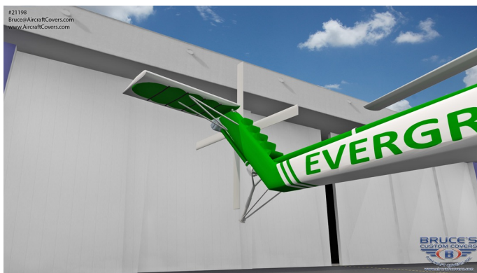
Sikorsky S-64 Canopy/Nose, Engine Area, Blade, Rotor, Tail Rotor Covers (illustration)

The Tailboom Cover details vary by model, but generally the helicopter tail boom cover encloses the tail boom from the "bottleneck" to the aft end. They usually also cover the horizontal stabilizers, and are custom made to allow for antennae, lights, and other protrusions. They attach with straps underneath the tail boom. Covers for the vertical and horizontal stabilizers are also available separately. Specific information for each model is available on request.