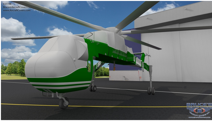
Sikorsky S-64 Canopy/Nose, Engine Area, Blade, Rotor, Tail Rotor Sikorsky S-64 Skycrane, CH-54 Tarhe Insulated Engine, Rotor Hub, Tailboom, Stabilizer & Tail Rotor Covers (illustration)