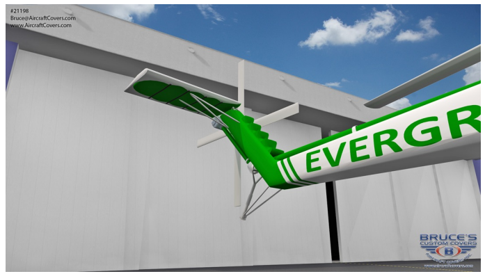
Sikorsky S-64 Canopy/Nose, Engine Area, Blade, Rotor, Tail Rotor Covers (illustration)