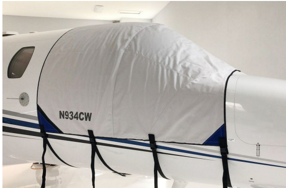
Cessna Citation M2 Cockpit Cover

This cover type is made from Silver Acrylic Sunbrella canvas and is 100% lined with a soft and smooth microfiber. Bruce's Custom Covers developed this material combination especially for aircraft protection. The outer material is medium weight and treated for water resistance, UV resistance and anti-static buildup. The inner lining is a very soft and smooth microfiber to prevent scratching. The material is very reflective, and tests show that the cabin interior temperature can be reduced to near-ambient temperature on the hottest of days. It is water, ice and snow repellent, yet breathable to allow moisture to escape from between the cover and the aircraft surface.