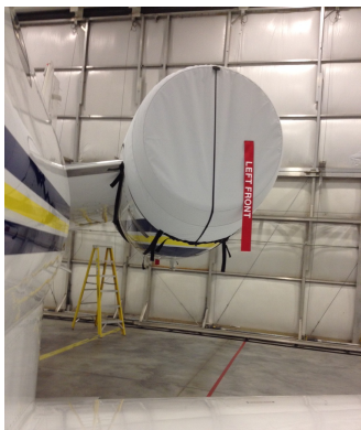
Cessna Citation 560XL Upper Nacelle/Brightwork Covers

and dried if necessary. Engine plugs have 'remove before flight' streamers sewn onto the face of the plugs. Most plugs are imprinted with the aircraft registration number in black. Engine plugs may be inserted after flight when the engine is still warm. Engine Inlet Plugs are commonly referred to as Cowl Plugs, Intake Plugs, Cowl Blocks, Engine Blocks, and Engine Bungs.