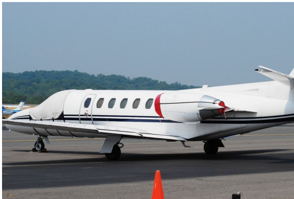
Cessna Citation S2 Cockpit Cover, Intake Covers & Exhaust Plugs