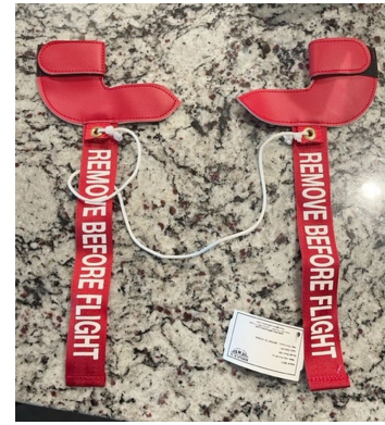
Cessna Citation Pitot Cover Set