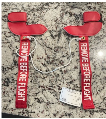
Cessna Citation Pitot Cover Set