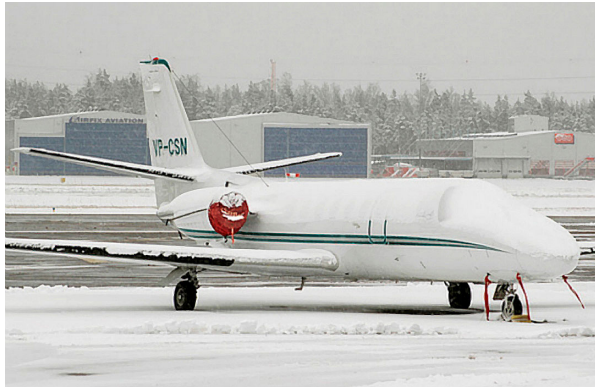
Cessna 560 Engine Inlet/Exhaust Covers, Pitot Cover Set

and dried if necessary. Engine plugs have 'remove before flight' streamers sewn onto the face of the plugs. Most plugs are imprinted with the aircraft registration number in black. Engine plugs may be inserted after flight when the engine is still warm. Engine Inlet Plugs are commonly referred to as Cowl Plugs, Intake Plugs, Cowl Blocks, Engine Blocks, and Engine Bungs.