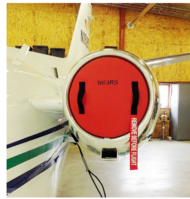
Cessna Citation S2 Intake Plugs