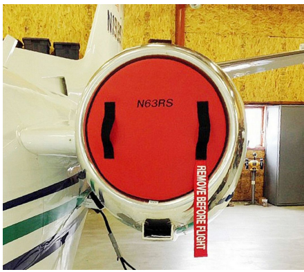
Cessna Citation S-550 Intake Plugs