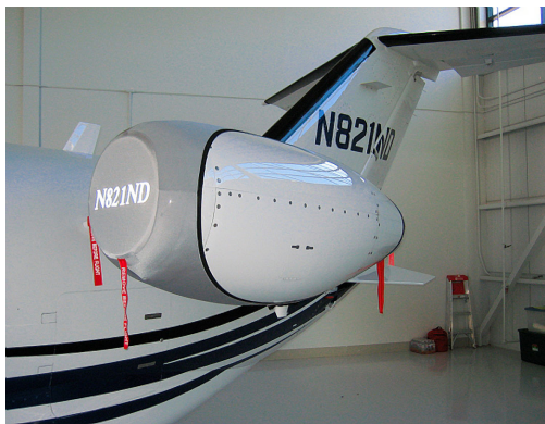
Cessna 510 Mustang Bikini Type Engine Cover