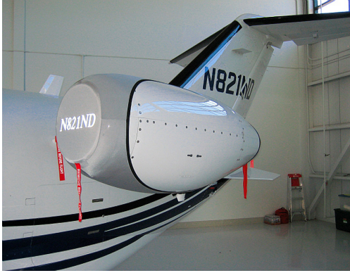
Cessna 510 Mustang Bikini Type Engine Cover

and dried if necessary. Engine plugs have 'remove before flight' streamers sewn onto the face of the plugs. Most plugs are imprinted with the aircraft registration number in black. Engine plugs may be inserted after flight when the engine is still warm. Engine Inlet Plugs are commonly referred to as Cowl Plugs, Intake Plugs, Cowl Blocks, Engine Blocks, and Engine Bungs.