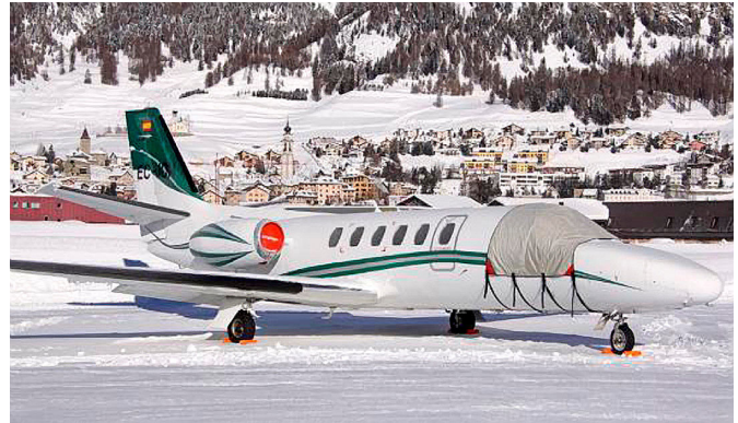
Cessna Citation 550 Windshield Cover