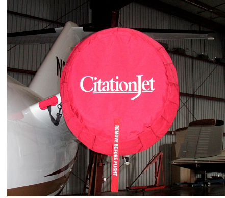
Cessna Citation Engine Cover Set