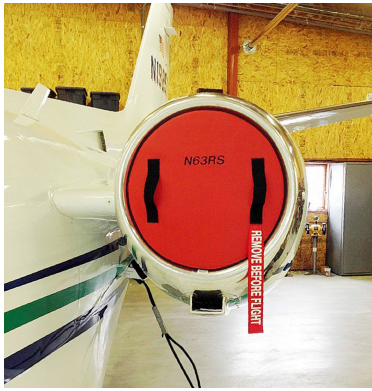
Cessna Citation S2 Intake Plugs