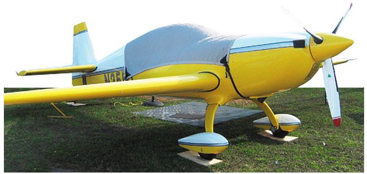
Extra 300/L Canopy Cover