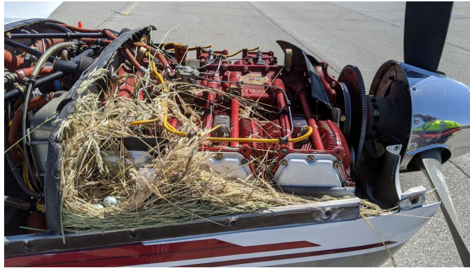
ENGINE PLUGS PREVENT BIRD NEST FOD. Piper Saratoga Engine Cowling Bird's Nest

Engine Inlet Plugs are custom fit for your Panzl S-330 intakes, made with heavy-duty vinyl material, and stuffed with a single block of sculpted urethane foam. Each plug has a zipper that allows the foam to be removed and dried if necessary. Engine plugs have warning flags that are visible from the cockpit or 'remove before flight' streamers sewn onto the face of the plugs. Most plugs are imprinted with the aircraft registration number in black for an extra charge. Storage bag NOT included. Engine plugs may be inserted after flight when the engine is still warm. Engine Inlet Plugs are commonly referred to as Cowl Plugs, Intake Plugs, Cowl Blocks, Engine Blocks, and Engine Bungs.