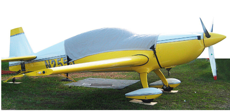
Xtremeair Canopy Cover