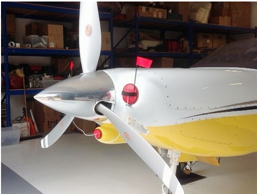
Swearingen SX300 Engine Inlet Plugs

Engine Inlet Plugs are custom fit for your Swearingen SX300 intakes, made with heavy-duty vinyl material, and stuffed with a single block of sculpted urethane foam. Each plug has a zipper that allows the foam to be removed and dried if necessary. Engine plugs have warning flags that are visible from the cockpit or 'remove before flight' streamers sewn onto the face of the plugs. Most plugs are imprinted with the aircraft registration number in black for an extra charge. Storage bag NOT included. Engine plugs may be inserted after flight when the engine is still warm. Engine Inlet Plugs are commonly referred to as Cowl Plugs, Intake Plugs, Cowl Blocks, Engine Blocks, and Engine Bungs.