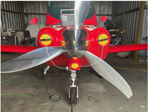
Swearingen SX-300 Engine Plugs