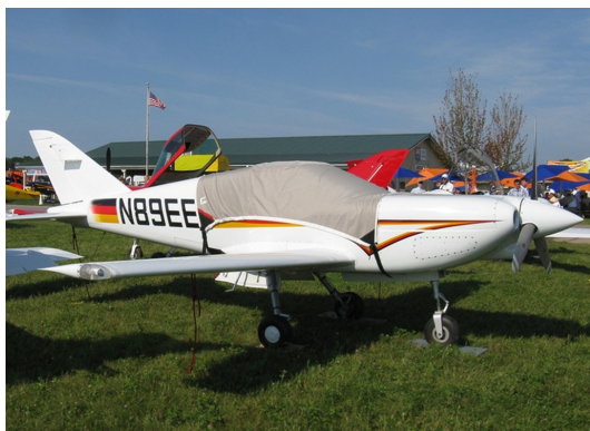
The Swearingen SX300 Canopy Cover

Travel Covers are made with Silver Solution-Dyed Polyester fabric and only lined over the windshield to save weight. The material is lightweight and more compact for easy stowage in the aircraft. The polyester material is water resistant, but only intended for occasional use outside. We also have an ultra lightweight material available for fitted hangar dust covers. For daily outdoor use, the non-travel Sunbrella Cover is the best choice.