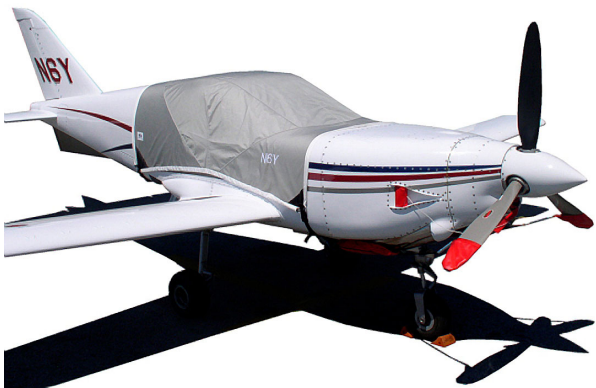
The Swearingen SX300 Canopy Cover, Engine Plugs & Prop Ties