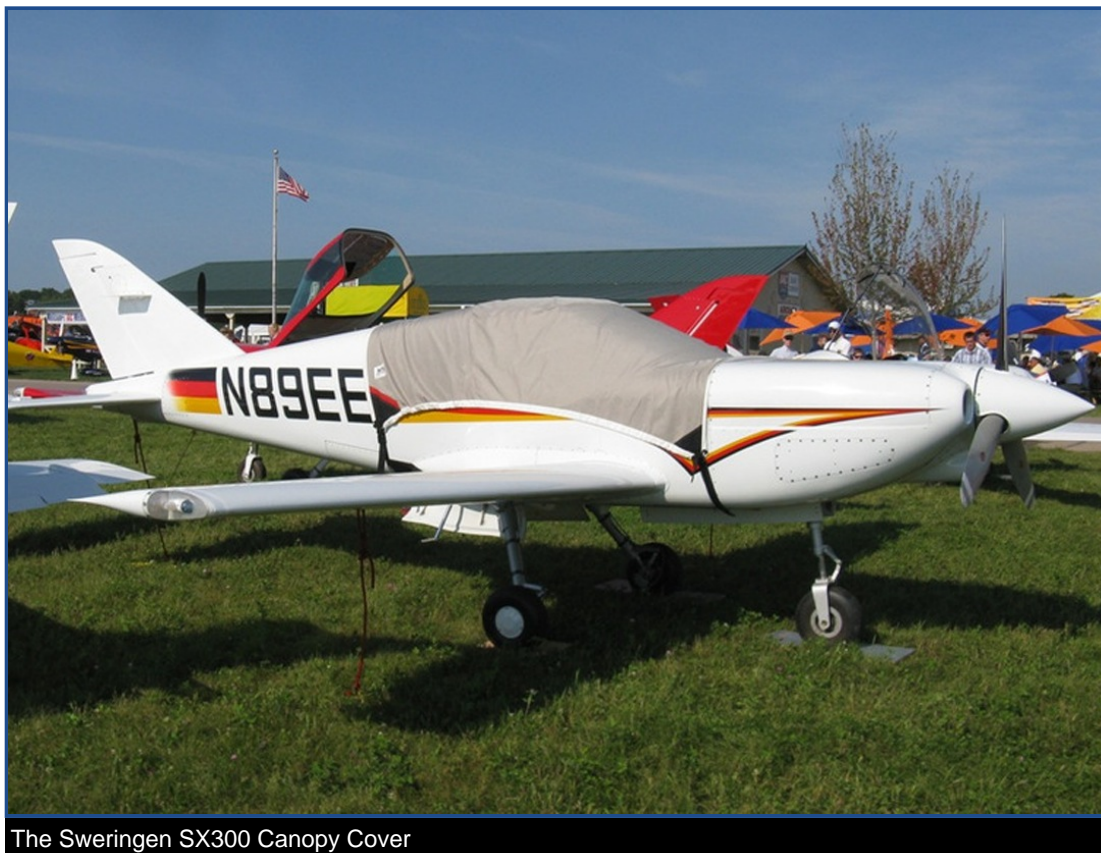
The Swearingen SX300 Canopy Cover