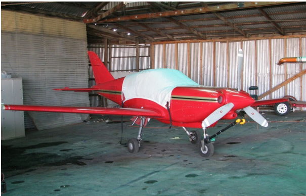
The Swearingen SX300 Canopy Cover