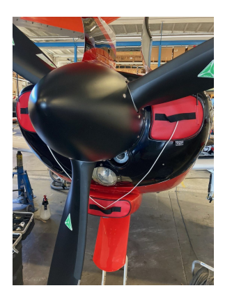
Siai Marchetti SF260 Engine Plugs