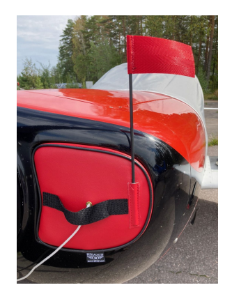
Siai Marchetti SF260 Engine Plugs

Engine Inlet Plugs are custom fit for your Siai Marchetti SF260 intakes, made with heavy-duty vinyl material, and stuffed with a single block of sculpted urethane foam. Each plug has a zipper that allows the foam to be removed and dried if necessary. Engine plugs have warning flags that are visible from the cockpit or 'remove before flight' streamers sewn onto the face of the plugs. Most plugs are imprinted with the aircraft registration number in black for an extra charge. Storage bag NOT included. Engine plugs may be inserted after flight when the engine is still warm. Engine Inlet Plugs are commonly referred to as Cowl Plugs, Intake Plugs, Cowl Blocks, Engine Blocks, and Engine Bungs.