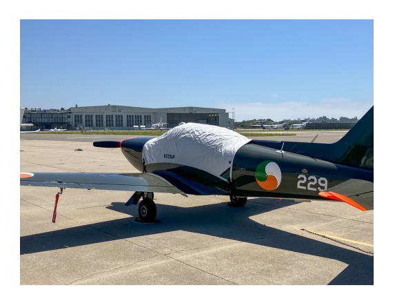
Siai Marchetti SF260 Canopy Cover