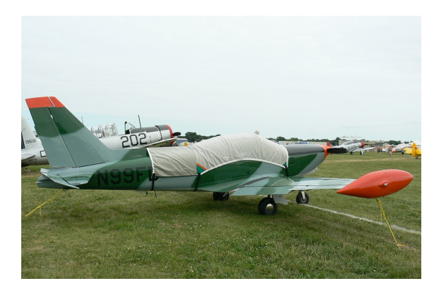
Siai Marchetti SF260 Canopy Cover with aft extension