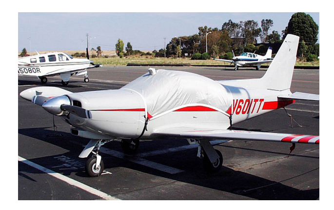
Standard Canopy Cover for Marchetti SF260

This cover type is made from Silver Acrylic Sunbrella canvas and is 100% lined with a soft and smooth microfiber. Bruce's Custom Covers developed this material combination especially for aircraft protection. The outer material is medium weight and treated for water resistance, UV resistance and anti-static buildup. The inner lining is a very soft and smooth microfiber to prevent scratching. The material is very reflective, and tests show that the cabin interior temperature can be reduced to near-ambient temperature on the hottest of days. It is water, ice and snow repellent, yet breathable to allow moisture to escape from between the cover and the aircraft surface.