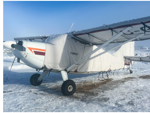
Stinson 108 Voyager Extended Canopy, Wing & Empennage Covers.