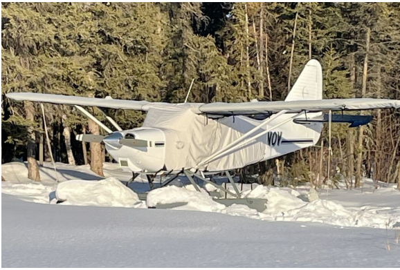
Stinson 108 Extended Canopy Cover, Wing Covers