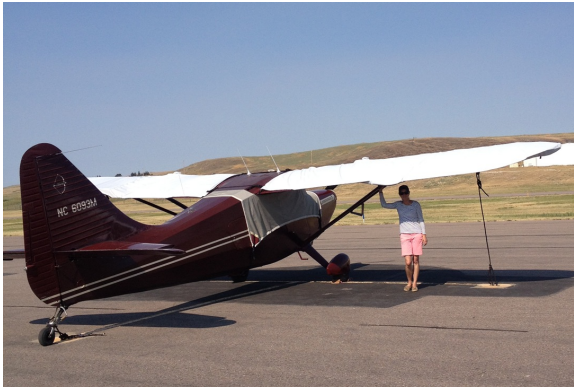
Stinson 108 Canopy Cover & Wing Covers