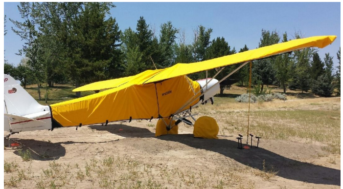
Cub Crafters CC19 Oversize Tire Covers, test fit cover Piper PA-18 Super Cub Extended Canopy Cover, Wing & Tire Covers