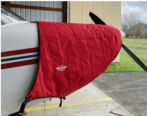
Stinson 108 Insulated Engine Cover