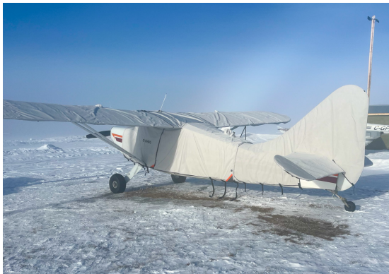
Stinson 108 Winter Cover Set

This cover type is made from Silver Acrylic Sunbrella canvas and is 100% lined with a soft and smooth microfiber. Bruce's Custom Covers developed this material combination especially for aircraft protection. The outer material is medium weight and treated for water resistance, UV resistance and anti-static buildup. The inner lining is a very soft and smooth microfiber to prevent scratching. The material is very reflective, and tests show that the cabin interior temperature can be reduced to near-ambient temperature on the hottest of days. It is water, ice and snow repellent, yet breathable to allow moisture to escape from between the cover and the aircraft surface.