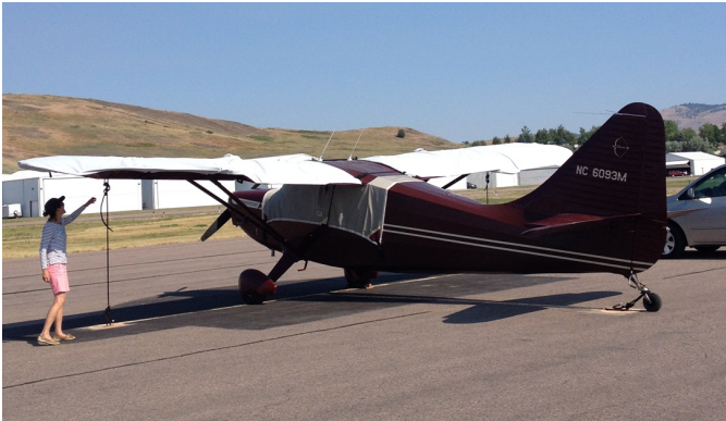
Stinson 108 Canopy Cover & Wing Covers

WINTER USE MATERIAL - Made with Solution-Dyed Polyester fabric, this option is intended for seasonal use to aid in deicing, rain mitigation, or for occasional travel. The material is lighter and more compact, but more susceptible to UV damage and may have a shorter useful life if used continuously outside than the all-year use material.