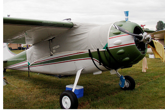
Cessna 195 Canopy Cover, extended forward and over gas caps