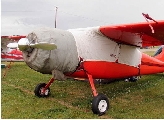
Cessna 195 Over-Top Canopy Cover & Engine Cover

The material is very reflective, and tests show that the cabin interior temperature can be reduced to near-ambient temperature on the hottest of days. It is water, ice and snow repellent, yet breathable to allow moisture to escape from between the cover and the aircraft surface.