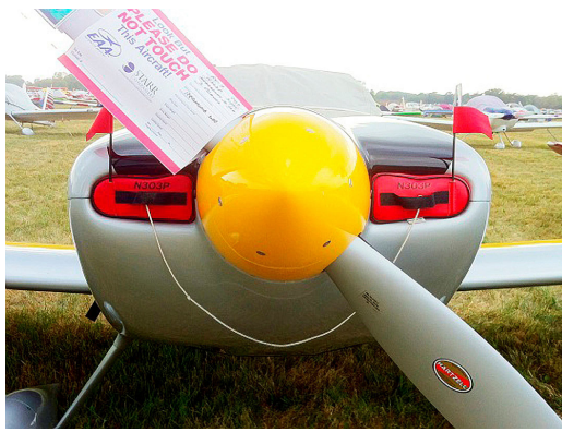
Vans's RV-7 Engine Engine Inlet Plugs