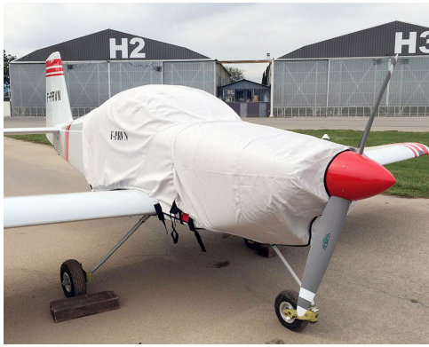
Van's Aircraft RV-9/9A Engine Cover