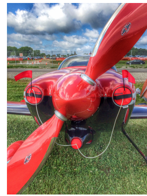
Van's RV-7 Engine Inlet Plugs