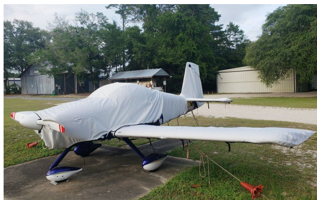
Van's RV-9A Extended Canopy/Engine, Wing & Empennage Covers