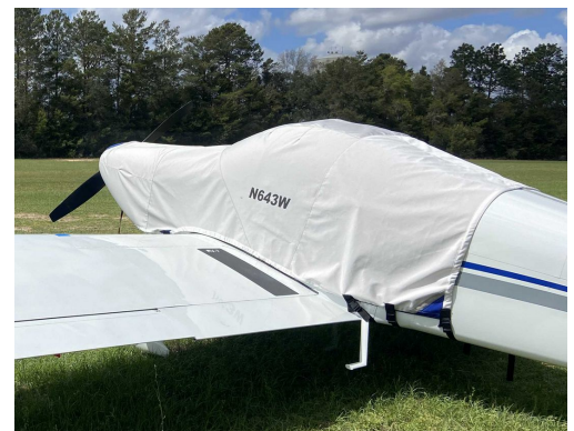
Van's RV-7 Extended Canopy/Engine Cover