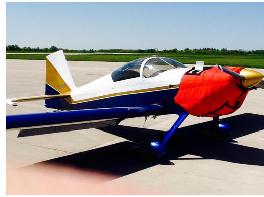
Van's RV-7 Insulated Engine Cover