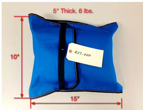
Van's RV-7/A Canopy Cover Weight & Dimensions (representative of an RV-6/A & RV-9/A cover)

This cover type is made from Silver Acrylic Sunbrella canvas and is 100% lined with a soft and smooth microfiber. Bruce's Custom Covers developed this material combination especially for aircraft protection. The outer material is medium weight and treated for water resistance, UV resistance and anti-static buildup. The inner lining is a very soft and smooth microfiber to prevent scratching. The material is very reflective, and tests show that the cabin interior temperature can be reduced to near-ambient temperature on the hottest of days. It is water, ice and snow repellent, yet breathable to allow moisture to escape from between the cover and the aircraft surface.