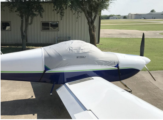
Van's RV-9A Travel Weight Canopy Cover

occasional use outside. We also have an ultra lightweight material available for fitted hangar dust covers. For daily outdoor use, the non-travel Sunbrella Cover is the best choice.