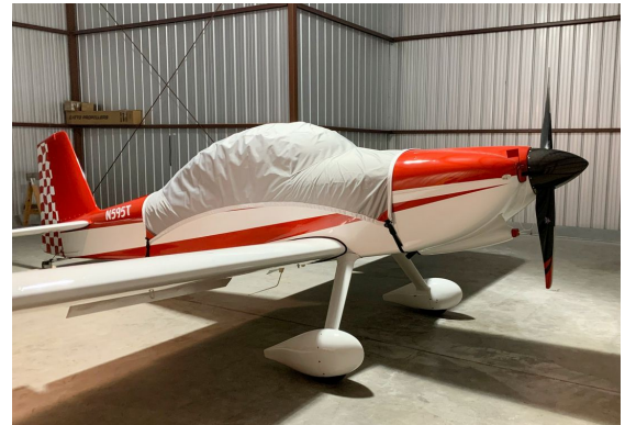
Van's RV-8 Canopy Cover