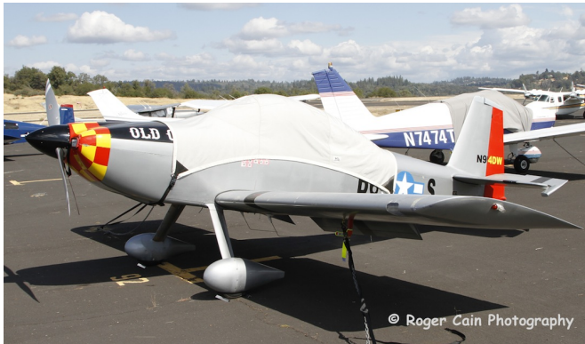
Van'ss RV-8 Canopy Cover

This cover type is made from Silver Acrylic Sunbrella canvas and is 100% lined with a soft and smooth microfiber. Bruce's Custom Covers developed this material combination especially for aircraft protection. The outer material is medium weight and treated for water resistance, UV resistance and anti-static buildup. The inner lining is a very soft and smooth microfiber to prevent scratching. The material is very reflective, and tests show that the cabin interior temperature can be reduced to near-ambient temperature on the hottest of days. It is water, ice and snow repellent, yet breathable to allow moisture to escape from between the cover and the aircraft surface.