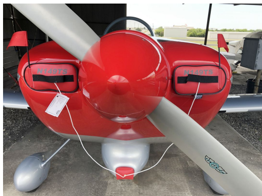
Van's RV-8 Engine Plugs, set of 3

Engine Inlet Plugs are custom fit for your Van's Aircraft RV-8/8A intakes, made with heavy-duty vinyl material, and stuffed with a single block of sculpted urethane foam. Each plug has a zipper that allows the foam to be removed and dried if necessary. Engine plugs have warning flags that are visible from the cockpit or 'remove before flight' streamers sewn onto the face of the plugs. Most plugs are imprinted with the aircraft registration number in black for an extra charge. Storage bag NOT included. Engine plugs may be inserted after flight when the engine is still warm. Engine Inlet Plugs are commonly referred to as Cowl Plugs, Intake Plugs, Cowl Blocks, Engine Blocks, and Engine Bungs.