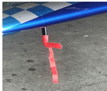
Van's RV-8 Pitot Cover