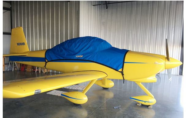
Van's RV-8/8A Travel Cover