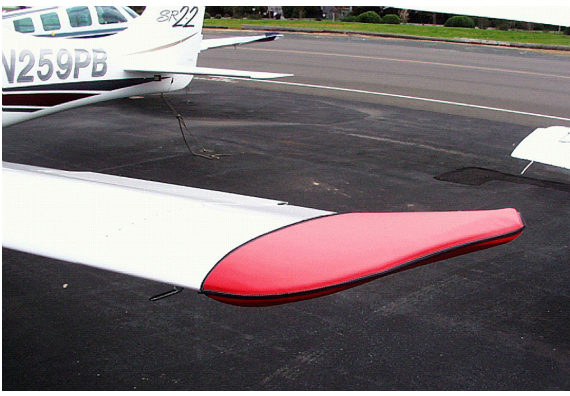
Cirrus SR-22 Wingtip Pad (also available for the Horiz. Stab.)