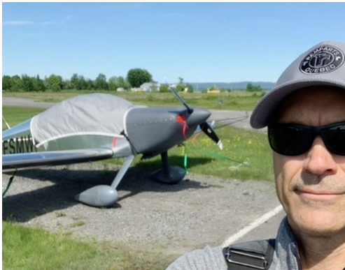
Van's RV-7 Travel Cover, Light Weight Canopy Cover