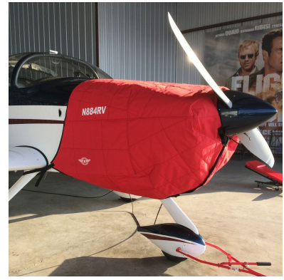
Van's RV-9A Insulated Engine Cover