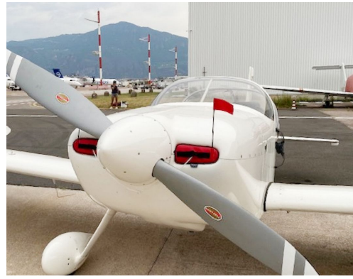
Van's RV7/7A Engine Inlet Plugs