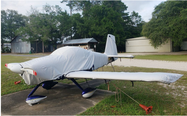
Van's RV-7A Cover Set