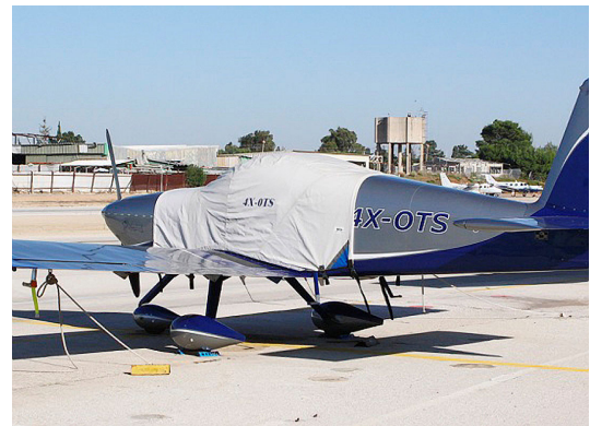
Van's RV-9A Extended Canopy Cover