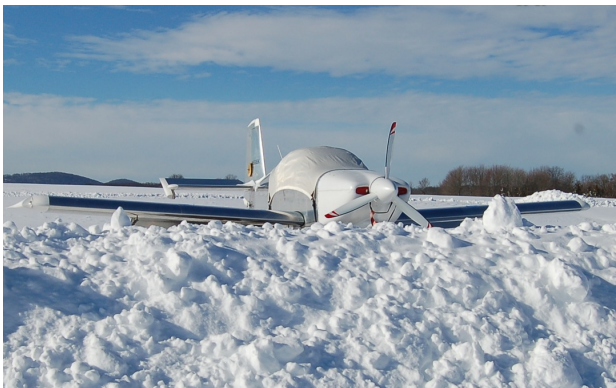
Van's RV-6 Canopy Cover

This cover type is made from Silver Acrylic Sunbrella canvas and is 100% lined with a soft and smooth microfiber. Bruce's Custom Covers developed this material combination especially for aircraft protection. The outer material is medium weight and treated for water resistance, UV resistance and anti-static buildup. The inner lining is a very soft and smooth microfiber to prevent scratching. The material is very reflective, and tests show that the cabin interior temperature can be reduced to near-ambient temperature on the hottest of days. It is water, ice and snow repellent, yet breathable to allow moisture to escape from between the cover and the aircraft surface.