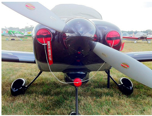
Van's RV-7 Engine Inlet Plugs