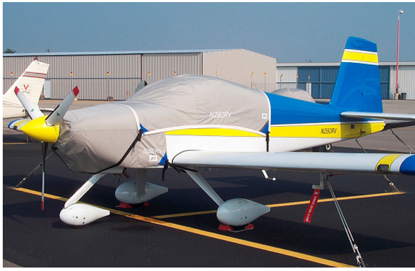
Van's RV-9 Canopy & Engine Covers