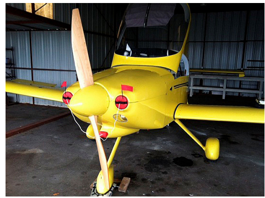
Van's RV-9A Engine Inlet Plugs