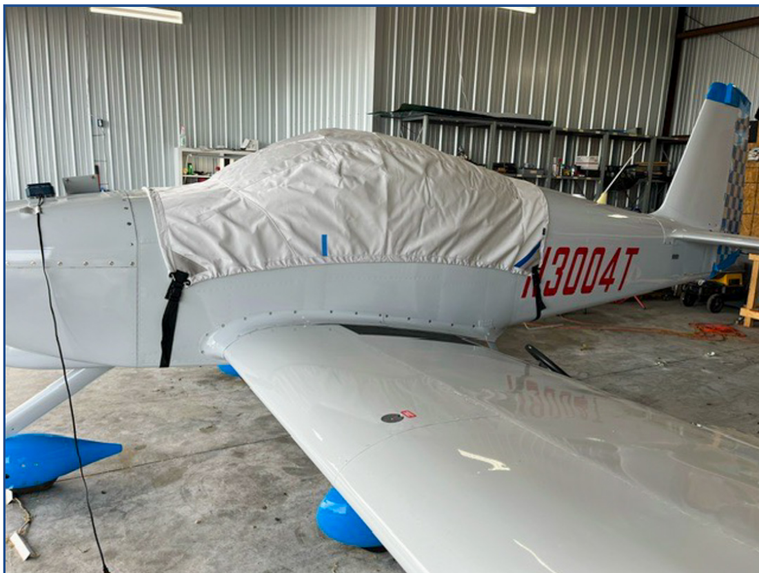
Van's RV-7 Canopy Cover