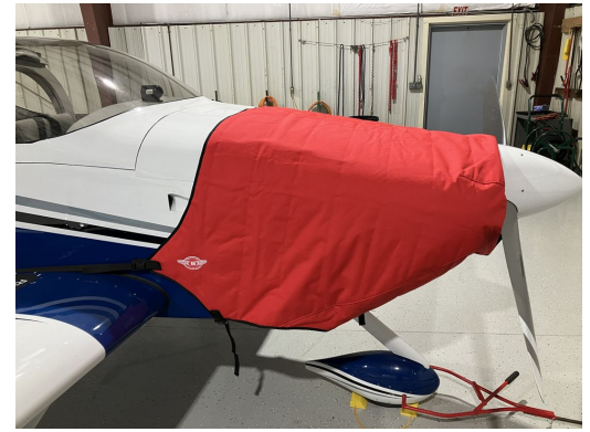
Van's Aircraft RV-7A Insulated Engine Cover