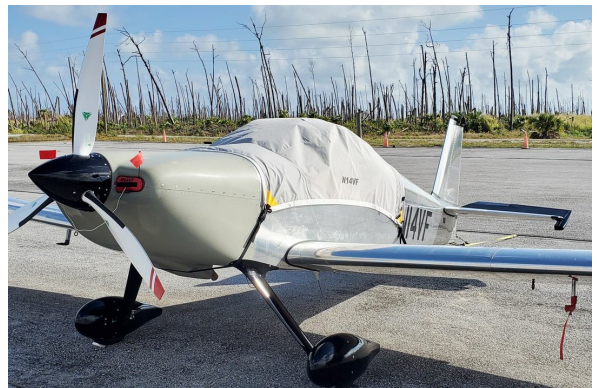
Van's RV-7 Canopy Cover, Engine Plugs