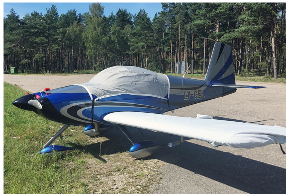
Van's RV-7/7A Travel and Wing Covers