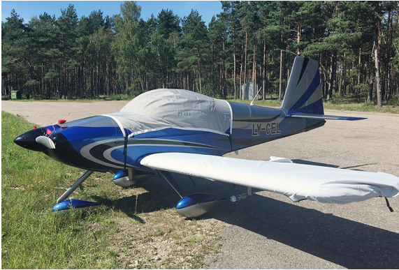
Van's RV-7/7A Travel and Wing Covers

WINTER USE MATERIAL - Made with Solution-Dyed Polyester fabric, this option is intended for seasonal use to aid in deicing, rain mitigation, or for occasional travel. The material is lighter and more compact, but more susceptible to UV damage and may have a shorter useful life if used continuously outside than the all-year use material.