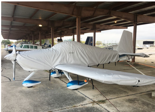
Van's RV-7A Complete Cover Set

This cover type is made from Silver Acrylic Sunbrella canvas and is 100% lined with a soft and smooth microfiber. Bruce's Custom Covers developed this material combination especially for aircraft protection. The outer material is medium weight and treated for water resistance, UV resistance and anti-static buildup. The inner lining is a very soft and smooth microfiber to prevent scratching. The material is very reflective, and tests show that the cabin interior temperature can be reduced to near-ambient temperature on the hottest of days. It is water, ice and snow repellent, yet breathable to allow moisture to escape from between the cover and the aircraft surface.