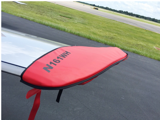
Cirrus SR-20/22 Wingtip Pads