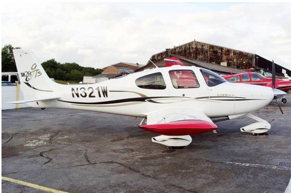
Cirrus SR-20/22 Wingtip Pads

Designed to prevent damage to the aircraft extremities in crowded hangars, these products are made of bright red Naugahyde and thickly padded with a sandwich of closed cell foam.