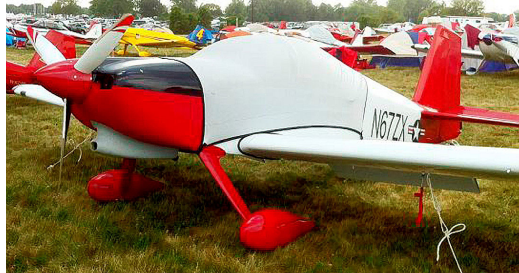
Light Weight Fitted Hangar Dust Cover

Travel Covers are made with Silver Solution-Dyed Polyester fabric and only lined over the windshield to save weight. The material is lightweight and more compact for easy stowage in the aircraft. The polyester material is water resistant, but only intended for occasional use outside. We also have an ultra lightweight material available for fitted hangar dust covers. For daily outdoor use, the non-travel Sunbrella Cover is the best choice.