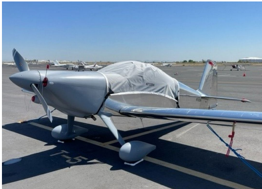
RV-7 Travel Cover, Travel Weight Canopy Cover

Travel Covers are made with Silver Solution-Dyed Polyester fabric and only lined over the windshield to save weight. The material is lightweight and more compact for easy stowage in the aircraft. The polyester material is water resistant, but only intended for occasional use outside. We also have an ultra lightweight material available for fitted hangar dust covers. For daily outdoor use, the non-travel Sunbrella Cover is the best choice.