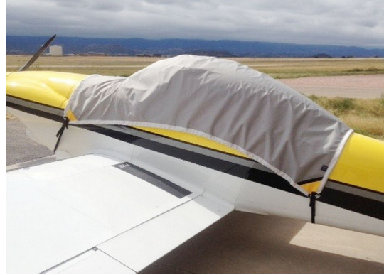
Van's Aircraft RV-4 Travel Cover, Light Weight Travel Canopy Cover, W/15" Fwd Extension, Belly Strap Type