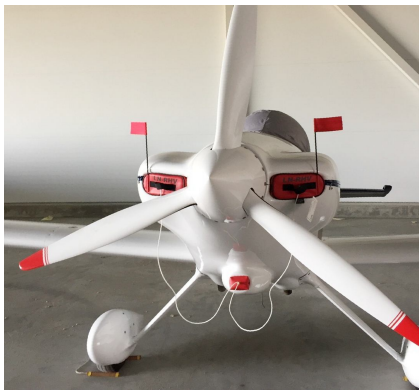
Van's RV-4 Engine Inlet Plugs

Engine Inlet Plugs are custom fit for your Van's Aircraft RV-4 intakes, made with heavy-duty vinyl material, and stuffed with a single block of sculpted urethane foam. Each plug has a zipper that allows the foam to be removed and dried if necessary. Engine plugs have warning flags that are visible from the cockpit or 'remove before flight' streamers sewn onto the face of the plugs. Most plugs are imprinted with the aircraft registration number in black for an extra charge. Storage bag NOT included. Engine plugs may be inserted after flight when the engine is still warm. Engine Inlet Plugs are commonly referred to as Cowl Plugs, Intake Plugs, Cowl Blocks, Engine Blocks, and Engine Bungs.