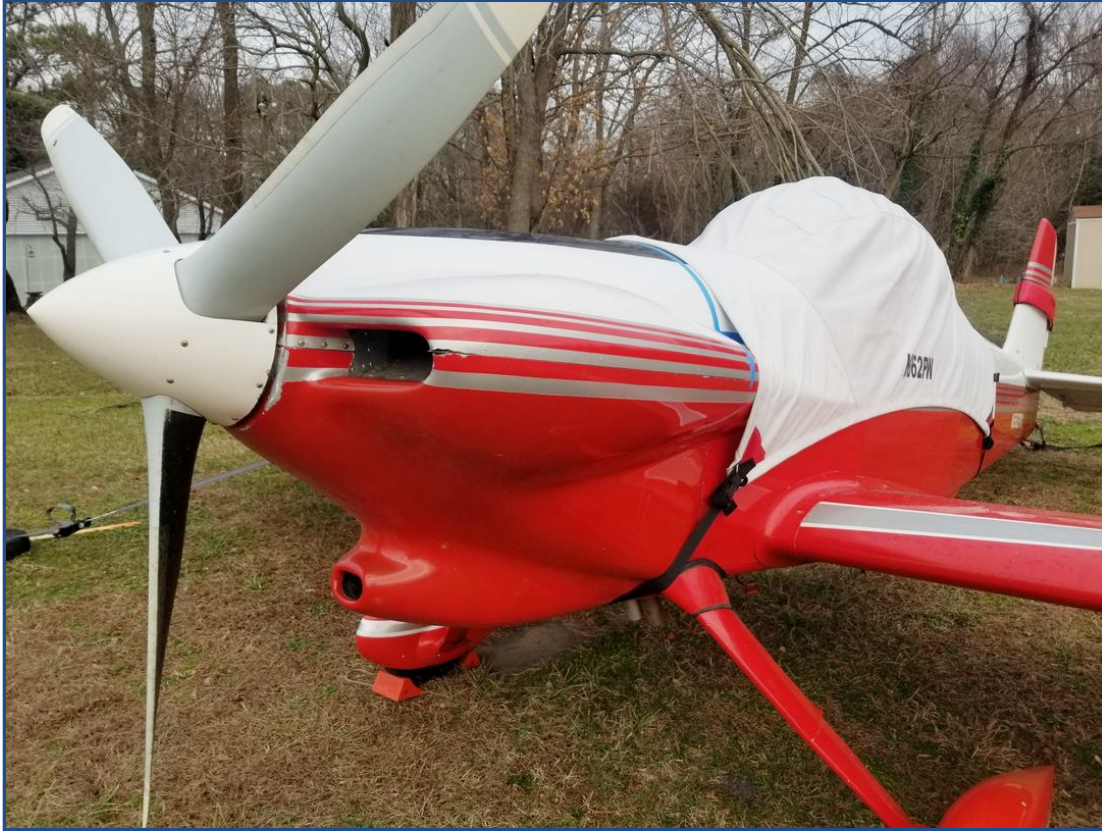
Vans RV-4 Canopy Cover