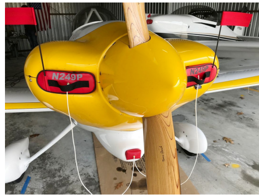
Van's RV-4 Engine Inlet Plugs