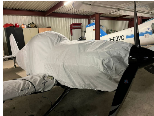
Harmon Rocket Canopy Cover & Engine Inlet Plugs Van's Aircraft RV-4 Complete Fuselage Cover W/Detachable Wing Covers