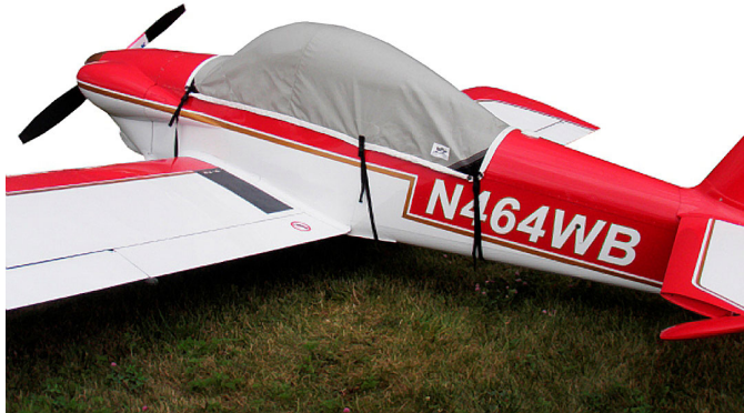
Vans's RV-3 Canopy Cover

This cover type is made from Silver Acrylic Sunbrella canvas and is 100% lined with a soft and smooth microfiber. Bruce's Custom Covers developed this material combination especially for aircraft protection. The outer material is medium weight and treated for water resistance, UV resistance and anti-static buildup. The inner lining is a very soft and smooth microfiber to prevent scratching. The material is very reflective, and tests show that the cabin interior temperature can be reduced to near-ambient temperature on the hottest of days. It is water, ice and snow repellent, yet breathable to allow moisture to escape from between the cover and the aircraft surface.