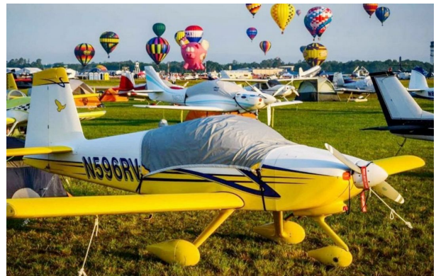
Vans's RV-9 Travel Weight Canopy Cover at Sun 'n Fun