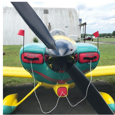
Van's Aircraft RV-4 Engine Inlet Plugs