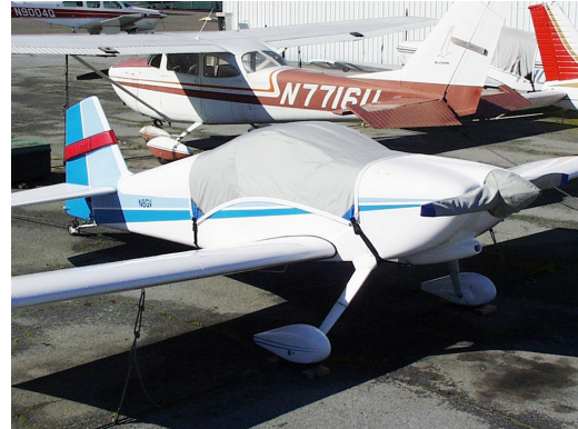
Vans's RV-6 Canopy Cover, Prop Cover