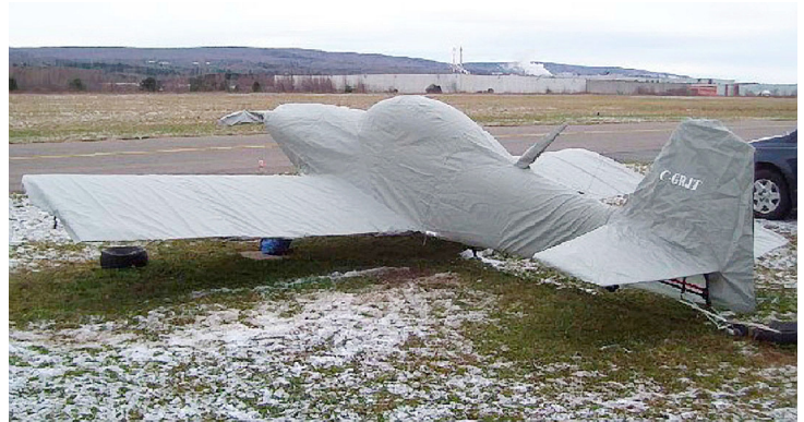
Van's RV-4 Complete Fuselage/Wing/Tail Surfaces cover