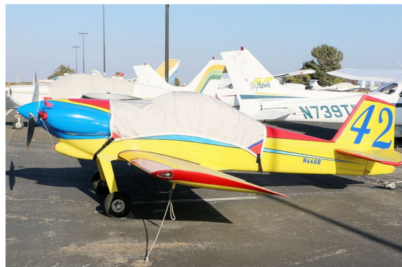
Van's RV-3 Canopy Cover and Engine Plugs