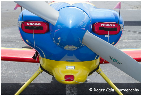
Van's RV-3 Engine Plugs