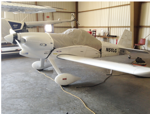
Van's RV-3 Light Weight Travel Cover

Travel Covers are made with Silver Solution-Dyed Polyester fabric and only lined over the windshield to save weight. The material is lightweight and more compact for easy stowage in the aircraft. The polyester material is water resistant, but only intended for occasional use outside. We also have an ultra lightweight material available for fitted hangar dust covers. For daily outdoor use, the non-travel Sunbrella Cover is the best choice.