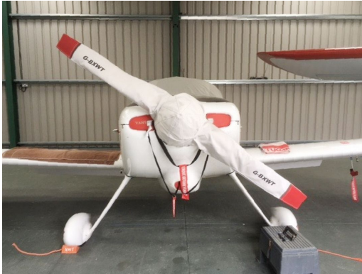
Van's RV-6 Prop/Spinner Cover

This cover type is made from Silver Acrylic Sunbrella canvas and is 100% lined with a soft and smooth microfiber. Bruce's Custom Covers developed this material combination especially for aircraft protection. The outer material is medium weight and treated for water resistance, UV resistance and anti-static buildup. The inner lining is a very soft and smooth microfiber to prevent scratching. The material is very reflective, and tests show that the cabin interior temperature can be reduced to near-ambient temperature on the hottest of days. It is water, ice and snow repellent, yet breathable to allow moisture to escape from between the cover and the aircraft surface.