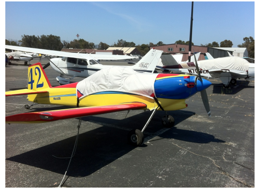
Vans's RV-3 Canopy Cover, Engine Plugs