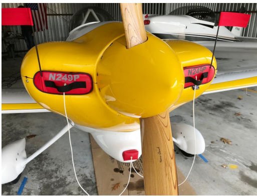
Van's RV-4 Engine Inlet Plugs