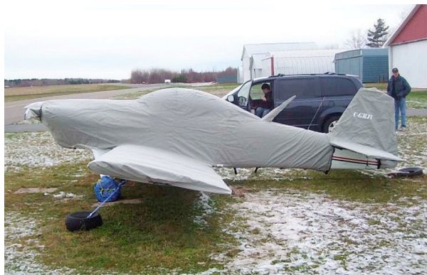
Van's RV-4 Complete Fuselage/Wing/Tail Surfaces cover

This cover type is made from Silver Acrylic Sunbrella canvas and is 100% lined with a soft and smooth microfiber. Bruce's Custom Covers developed this material combination especially for aircraft protection. The outer material is medium weight and treated for water resistance, UV resistance and anti-static buildup. The inner lining is a very soft and smooth microfiber to prevent scratching. The material is very reflective, and tests show that the cabin interior temperature can be reduced to near-ambient temperature on the hottest of days. It is water, ice and snow repellent, yet breathable to allow moisture to escape from between the cover and the aircraft surface.