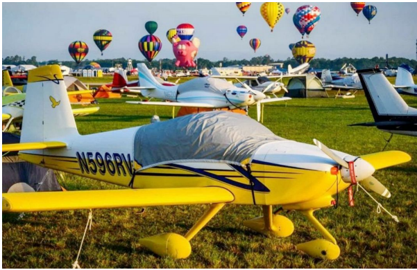
Vans's RV-9 Travel Weight Canopy Cover at Sun 'n Fun

Travel Covers are made with Silver Solution-Dyed Polyester fabric and only lined over the windshield to save weight. The material is lightweight and more compact for easy stowage in the aircraft. The polyester material is water resistant, but only intended for occasional use outside. We also have an ultra lightweight material available for fitted hangar dust covers. For daily outdoor use, the non-travel Sunbrella Cover is the best choice.