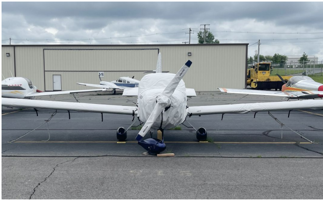
Vans RV-12 Complete Cover Set