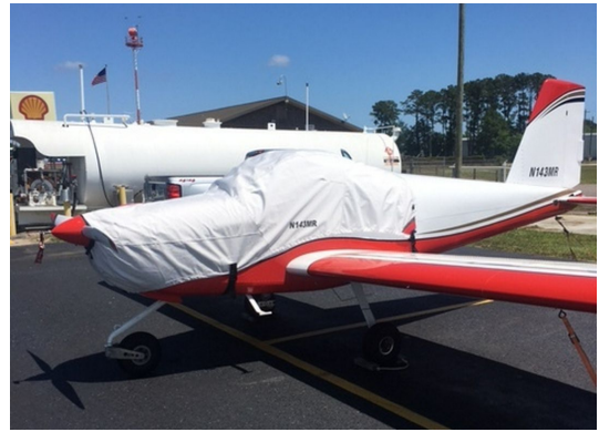
Van's RV-12 Canopy/Engine Cover