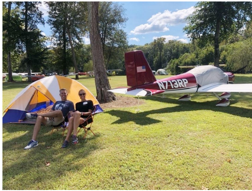
Van's RV-12 Light Weight Travel Cover

Travel Covers are made with Silver Solution-Dyed Polyester fabric and only lined over the windshield to save weight. The material is lightweight and more compact for easy stowage in the aircraft. The polyester material is water resistant, but only intended for occasional use outside. We also have an ultra lightweight material available for fitted hangar dust covers. For daily outdoor use, the non-travel Sunbrella Cover is the best choice.