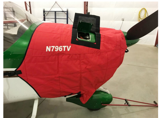
Van's RV-12 Insulated Engine Cover