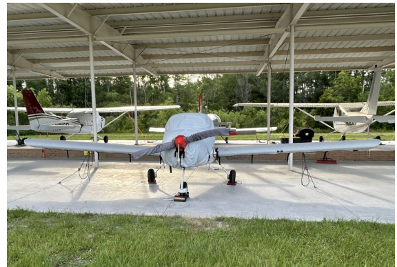
Van's RV-12 Canopy/Engine & Wing Covers