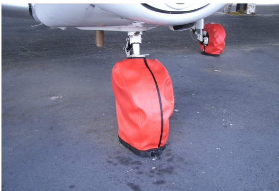
Piper PA28-140 Tire Covers

ALL-YEAR USE MATERIAL - Made with Silver Acrylic Sunbrella canvas, the all-year use material is the best option for sun protection and cover longevity. This heavier more durable material is intended for all weather conditions, such as rain and snow or lots of sun.