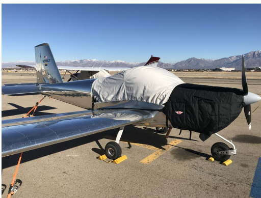
Van's RV-12 Canopy Cover, Insulated Engine Cover

This cover type is made from Silver Acrylic Sunbrella canvas and is 100% lined with a soft and smooth microfiber. Bruce's Custom Covers developed this material combination especially for aircraft protection. The outer material is medium weight and treated for water resistance, UV resistance and anti-static buildup. The inner lining is a very soft and smooth microfiber to prevent scratching. The material is very reflective, and tests show that the cabin interior temperature can be reduced to near-ambient temperature on the hottest of days. It is water, ice and snow repellent, yet breathable to allow moisture to escape from between the cover and the aircraft surface.