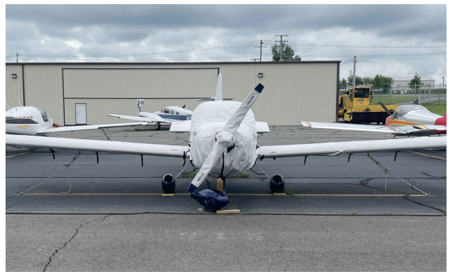
Vans RV-12 Complete Cover Set