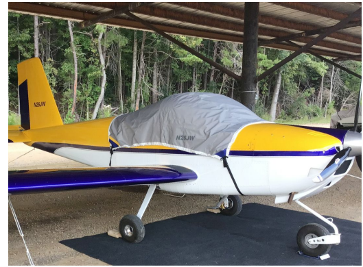
Van's RV-12IS Light Weight Travel Cover