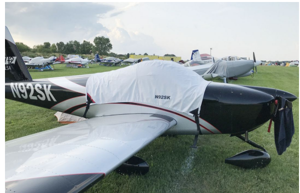
Van's RV-12 Canopy Cover