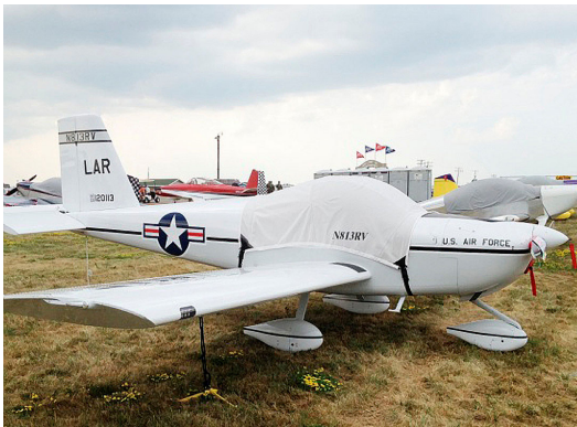
Vans's RV-12 Canopy Cover & Engine Plugs

This cover type is made from Silver Acrylic Sunbrella canvas and is 100% lined with a soft and smooth microfiber. Bruce's Custom Covers developed this material combination especially for aircraft protection. The outer material is medium weight and treated for water resistance, UV resistance and anti-static buildup. The inner lining is a very soft and smooth microfiber to prevent scratching. The material is very reflective, and tests show that the cabin interior temperature can be reduced to near-ambient temperature on the hottest of days. It is water, ice and snow repellent, yet breathable to allow moisture to escape from between the cover and the aircraft surface.