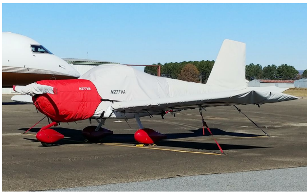
Van's Aircraft RV-12 Insulated Engine Cover, Other Covers too!