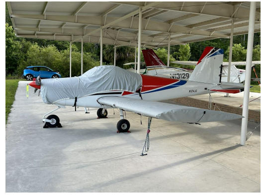
Van's RV-12 Canopy/Engine & Wing Covers