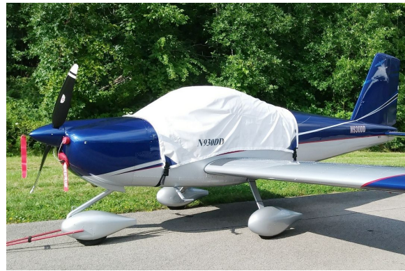
Van's Aircraft RV-12 Canopy Cover