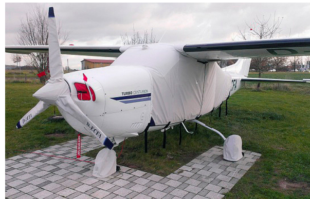
Cessna 210 Extended Canopy Cover, Engine Plugs, Prop and Tire Covers