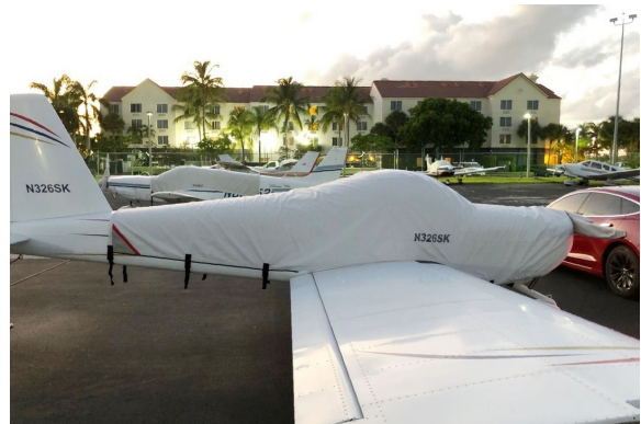
Van's RV-12 Extended Canopy/Engine Cover (special: extends to tail)