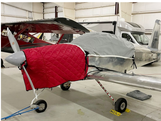
Vans RV-7 Travel Canopy Cover, Hangar Blanket

This cover type is made from Silver Acrylic Sunbrella canvas and is 100% lined with a soft and smooth microfiber. Bruce's Custom Covers developed this material combination especially for aircraft protection. The outer material is medium weight and treated for water resistance, UV resistance and anti-static buildup. The inner lining is a very soft and smooth microfiber to prevent scratching. The material is very reflective, and tests show that the cabin interior temperature can be reduced to near-ambient temperature on the hottest of days. It is water, ice and snow repellent, yet breathable to allow moisture to escape from between the cover and the aircraft surface.