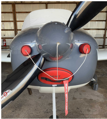
Vans RV-12 Engine Plugs

Engine Inlet Plugs are custom fit for your Van's Aircraft RV-12 & RV-12is intakes, made with heavy-duty vinyl material, and stuffed with a single block of sculpted urethane foam. Each plug has a zipper that allows the foam to be removed and dried if necessary. Engine plugs have warning flags that are visible from the cockpit or 'remove before flight' streamers sewn onto the face of the plugs. Most plugs are imprinted with the aircraft registration number in black for an extra charge. Storage bag NOT included. Engine plugs may be inserted after flight when the engine is still warm. Engine Inlet Plugs are commonly referred to as Cowl Plugs, Intake Plugs, Cowl Blocks, Engine Blocks, and Engine Bung.