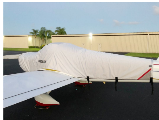
Van's RV-12 Extended Canopy/Engine Cover (special: extends to tail)