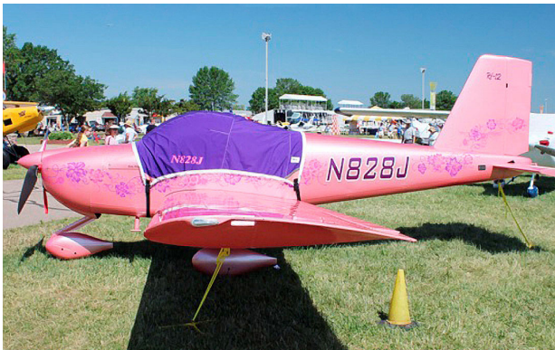
Van's RV-12 Canopy Cover

This cover type is made from Silver Acrylic Sunbrella canvas and is 100% lined with a soft and smooth microfiber. Bruce's Custom Covers developed this material combination especially for aircraft protection. The outer material is medium weight and treated for water resistance, UV resistance and anti-static buildup. The inner lining is a very soft and smooth microfiber to prevent scratching. The material is very reflective, and tests show that the cabin interior temperature can be reduced to near-ambient temperature on the hottest of days. It is water, ice and snow repellent, yet breathable to allow moisture to escape from between the cover and the aircraft surface.