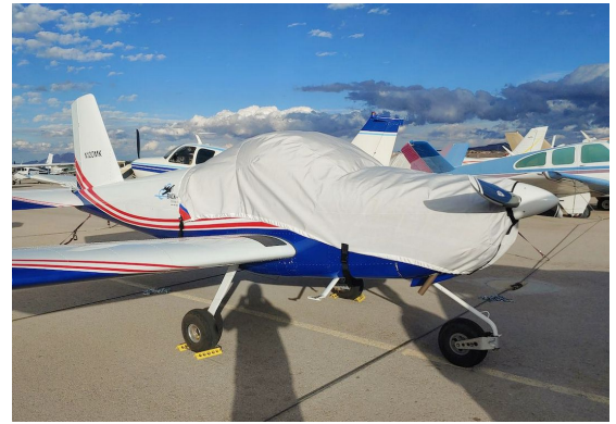
Vans RV-12 Canopy/Engine Cover