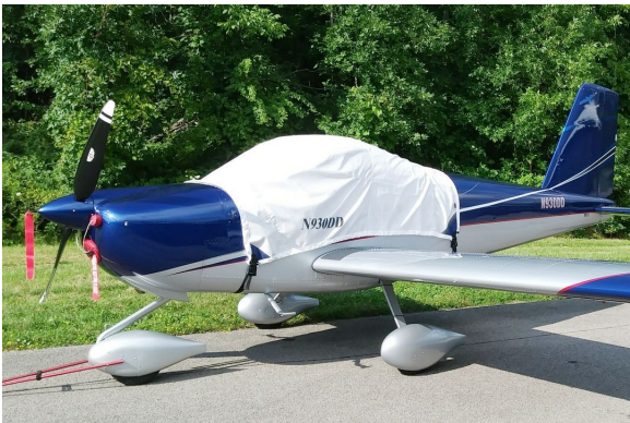
Van's Aircraft RV-12 Canopy Cover

Engine Inlet Plugs are custom fit for your Van's Aircraft RV-12 & RV-12is intakes, made with heavy-duty vinyl material, and stuffed with a single block of sculpted urethane foam. Each plug has a zipper that allows the foam to be removed and dried if necessary. Engine plugs have warning flags that are visible from the cockpit or 'remove before flight' streamers sewn onto the face of the plugs. Most plugs are imprinted with the aircraft registration number in black for an extra charge. Storage bag NOT included. Engine plugs may be inserted after flight when the engine is still warm. Engine Inlet Plugs are commonly referred to as Cowl Plugs, Intake Plugs, Cowl Blocks, Engine Blocks, and Engine Bung.