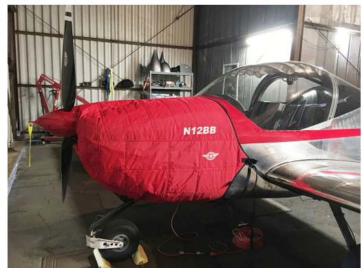
Van's RV-12 Insulated Engine Cover