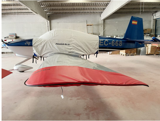
Van's RV-10 Extended Canopy Cover, Wingtip Pads

Designed to prevent damage to the aircraft extremities in crowded hangars, these products are made of bright red Naugahyde and thickly padded with a sandwich of closed cell foam.