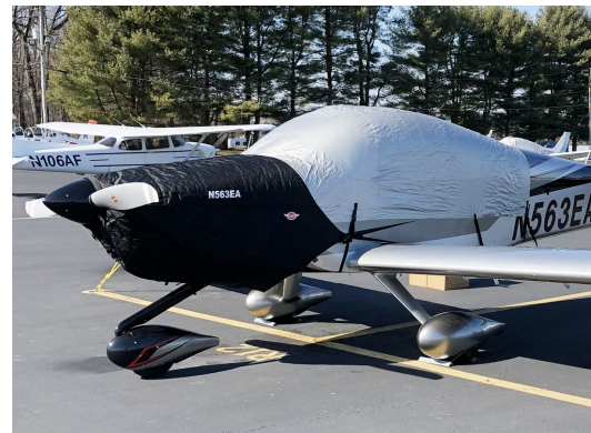
Van's RV-10 Insulated Engine Cover