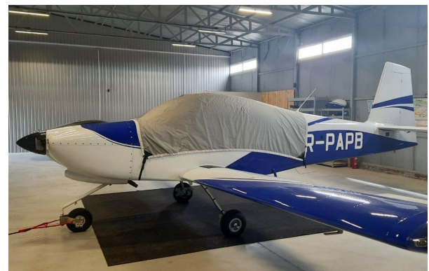
Van's RV-10 Travel Weight Canopy Cover