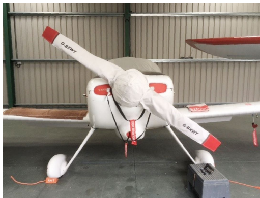
Van's RV-6 Prop/Spinner Cover

This cover type is made from Silver Acrylic Sunbrella canvas and is 100% lined with a soft and smooth microfiber. Bruce's Custom Covers developed this material combination especially for aircraft protection. The outer material is medium weight and treated for water resistance, UV resistance and anti-static buildup. The inner lining is a very soft and smooth microfiber to prevent scratching. The material is very reflective, and tests show that the cabin interior temperature can be reduced to near-ambient temperature on the hottest of days. It is water, ice and snow repellent, yet breathable to allow moisture to escape from between the cover and the aircraft surface.