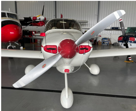
Van's RV-10 Engine Inlet Plugs

Engine Inlet Plugs are custom fit for your Van's Aircraft RV-10 intakes, made with heavy-duty vinyl material, and stuffed with a single block of sculpted urethane foam. Each plug has a zipper that allows the foam to be removed and dried if necessary. Engine plugs have warning flags that are visible from the cockpit or 'remove before flight' streamers sewn onto the face of the plugs. Most plugs are imprinted with the aircraft registration number in black for an extra charge. Storage bag NOT included. Engine plugs may be inserted after flight when the engine is still warm. Engine Inlet Plugs are commonly referred to as Cowl Plugs, Intake Plugs, Cowl Blocks, Engine Blocks, and Engine Bung.