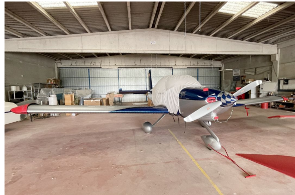
Van's RV-10 Extended Canopy Cover, Wingtip Pads, Engine Plugs