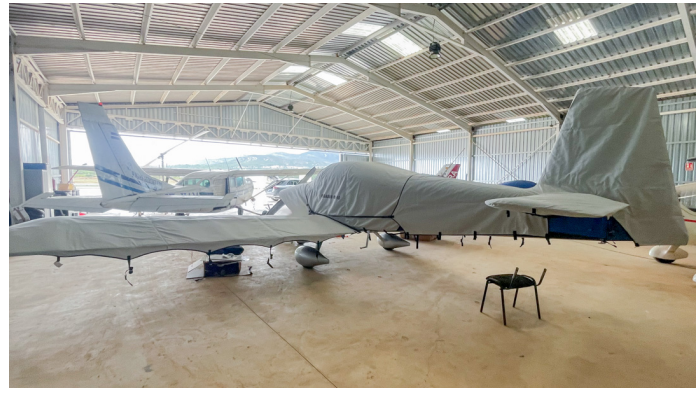
Van's RV-10 Full Cover Set