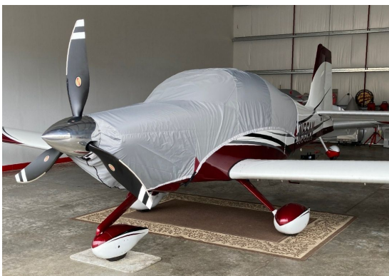
Van's RV-10 Travel Cover

Travel Covers are made with Silver Solution-Dyed Polyester fabric and only lined over the windshield to save weight. The material is lightweight and more compact for easy stowage in the aircraft. The polyester material is water resistant, but only intended for occasional use outside. We also have an ultra lightweight material available for fitted hangar dust covers. For daily outdoor use, the non-travel Sunbrella Cover is the best choice.