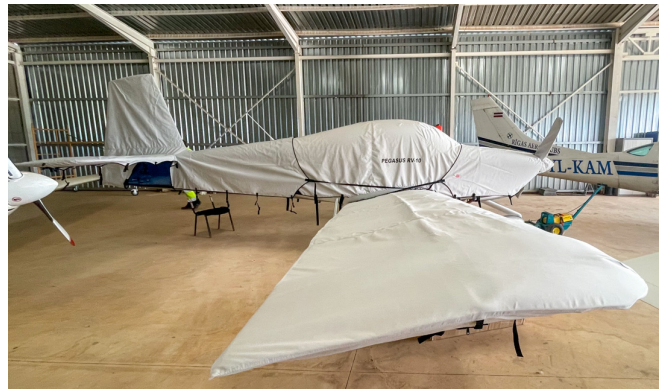
Van's RV-10 Full Cover Set