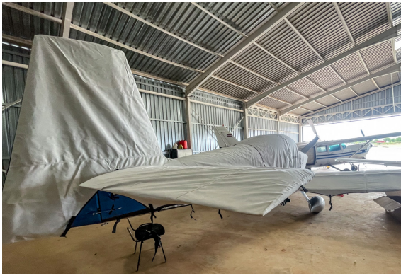
Van's RV-10 Full Cover Set