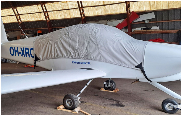
RV-10 Canopy Cover

This cover type is made from Silver Acrylic Sunbrella canvas and is 100% lined with a soft and smooth microfiber. Bruce's Custom Covers developed this material combination especially for aircraft protection. The outer material is medium weight and treated for water resistance, UV resistance and anti-static buildup. The inner lining is a very soft and smooth microfiber to prevent scratching. The material is very reflective, and tests show that the cabin interior temperature can be reduced to near-ambient temperature on the hottest of days. It is water, ice and snow repellent, yet breathable to allow moisture to escape from between the cover and the aircraft surface.