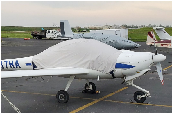
Diamond DA-20 Katana

This cover type is made from Silver Acrylic Sunbrella canvas and is 100% lined with a soft and smooth microfiber. Bruce's Custom Covers developed this material combination especially for aircraft protection. The outer material is medium weight and treated for water resistance, UV resistance and anti-static buildup. The inner lining is a very soft and smooth microfiber to prevent scratching. The material is very reflective, and tests show that the cabin interior temperature can be reduced to near-ambient temperature on the hottest of days. It is water, ice and snow repellent, yet breathable to allow moisture to escape from between the cover and the aircraft surface.