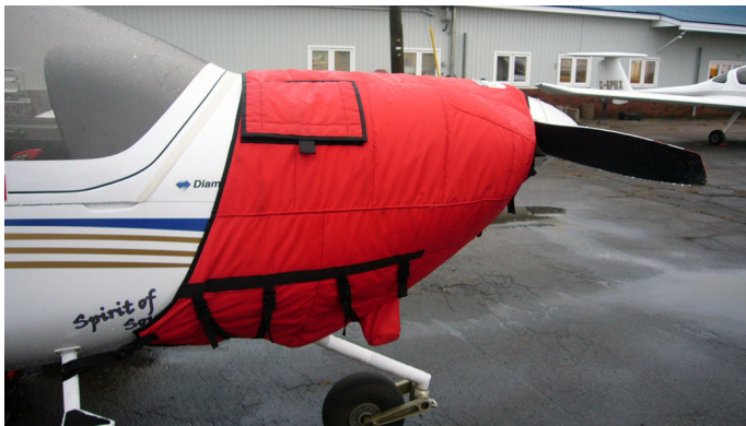
Diamond DA-20-C1 Insulated Engine Cover

This cover type is made from Silver Acrylic Sunbrella canvas and is 100% lined with a soft and smooth microfiber. Bruce's Custom Covers developed this material combination especially for aircraft protection. The outer material is medium weight and treated for water resistance, UV resistance and anti-static buildup. The inner lining is a very soft and smooth microfiber to prevent scratching. The material is very reflective, and tests show that the cabin interior temperature can be reduced to near-ambient temperature on the hottest of days. It is water, ice and snow repellent, yet breathable to allow moisture to escape from between the cover and the aircraft surface.