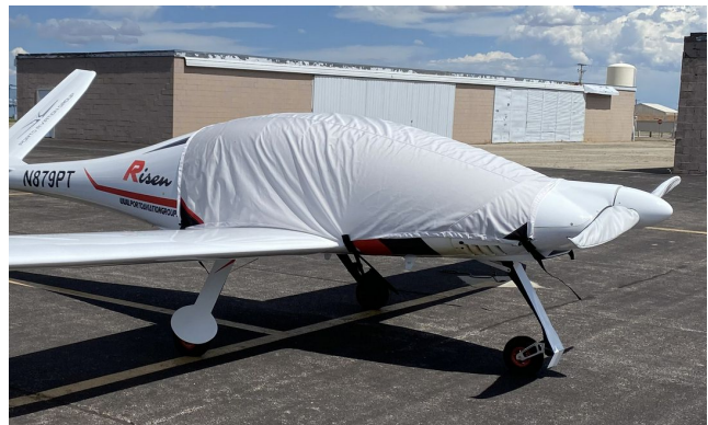
Swiss Excellence Risen 914 Canopy Cover