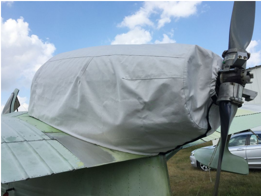
Republic Seabee Engine Cover