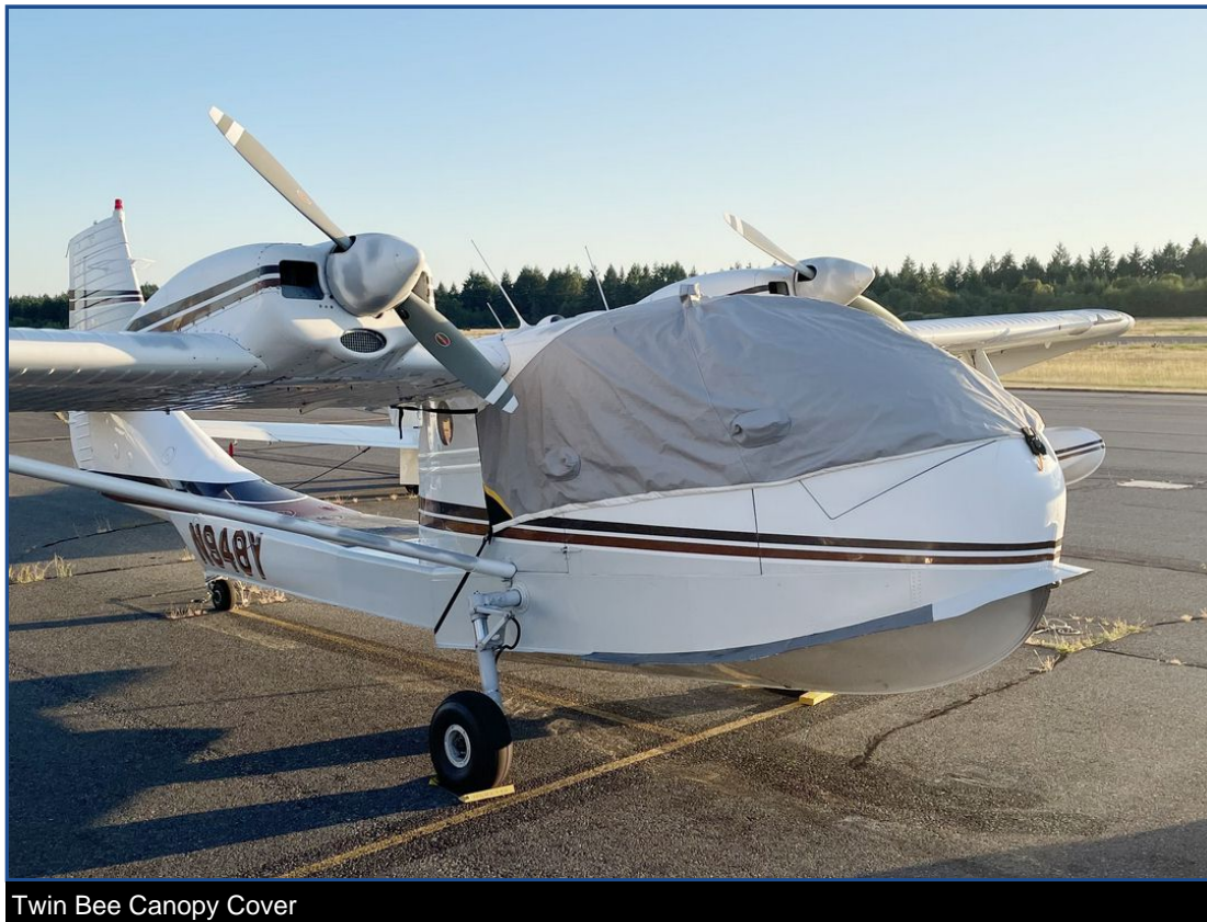
Twin Bee Canopy Cover