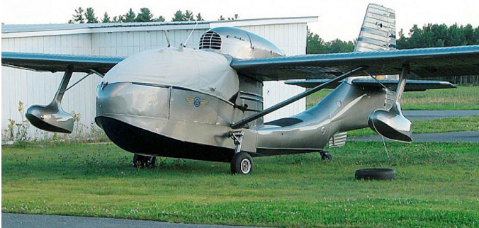
Seabee Canopy Cover

This cover type is made from Silver Acrylic Sunbrella canvas and is 100% lined with a soft and smooth microfiber. Bruce's Custom Covers developed this material combination especially for aircraft protection. The outer material is medium weight and treated for water resistance, UV resistance and anti-static buildup. The inner lining is a very soft and smooth microfiber to prevent scratching. The material is very reflective, and tests show that the cabin interior temperature can be reduced to near-ambient temperature on the hottest of days. It is water, ice and snow repellent, yet breathable to allow moisture to escape from between the cover and the aircraft surface.